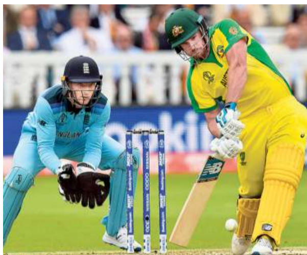
In the zone: Finch found his range yet again.