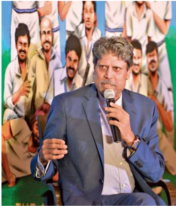
Nostalgia: Kapil Dev shares interesting anecdotes connected with India's first World Cup triumph during the book launch.

"During those days, the fielding drills were not like what you see today. Today, it