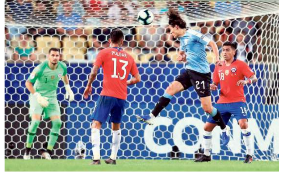
Firing it in: Edinson Cavani's perfectly-timed header against Chile gave Uruguay the bragging rights in Group C on Monday.

Meets Peru in quarterfinals; Japan and Ecuador eliminated