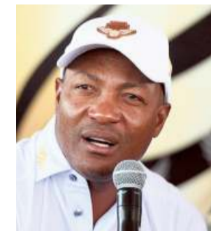
Brian Lara.