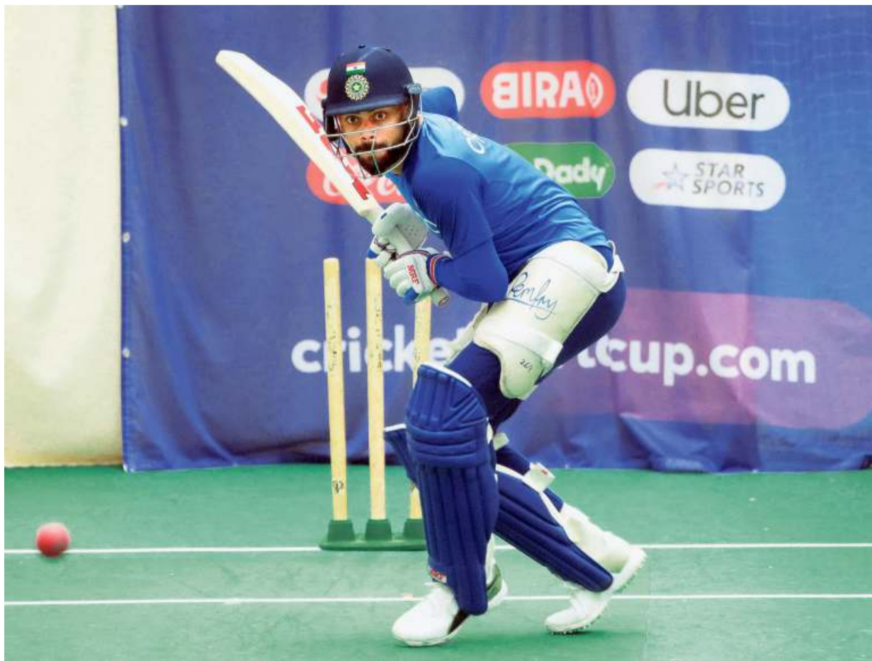
Eye for perfection: Virat Kohli displayed twinkle-toes and finesse during an indoor nets session at Old Trafford on Tuesday.

Understandably, the Indian team cancelled its scheduled practice stint and instead opted for a round of optional nets at the indoor facility with its massive black and white picture of Wasim Ak-