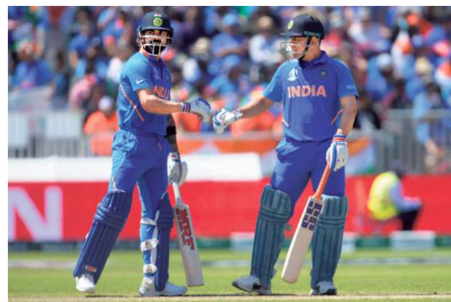
Takes two to tango: Skipper Virat Kohli (72) and Mahendra Singh Dhoni (56) took India to 268 for seven in the World Cup match against the West Indies at Old Trafford on Thursday before the bowlers bundled out the Caribbeans for 143. Kohli overtook Sachin Tendulkar and Brian Lara to become the fastest to score 20,000 International runs (417 innings).