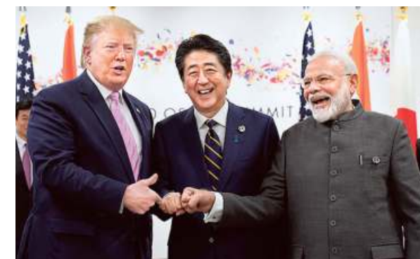
Productive talks: Donald Trump, Shinzo Abe and Narendra Modi in Osaka on Friday.

Mr. Modi thanked Mr. Trump for expressing his "love towards India" in a letter delivered by U.S. Secretary of State Mike Pompeo, who was in Delhi earlier this week.