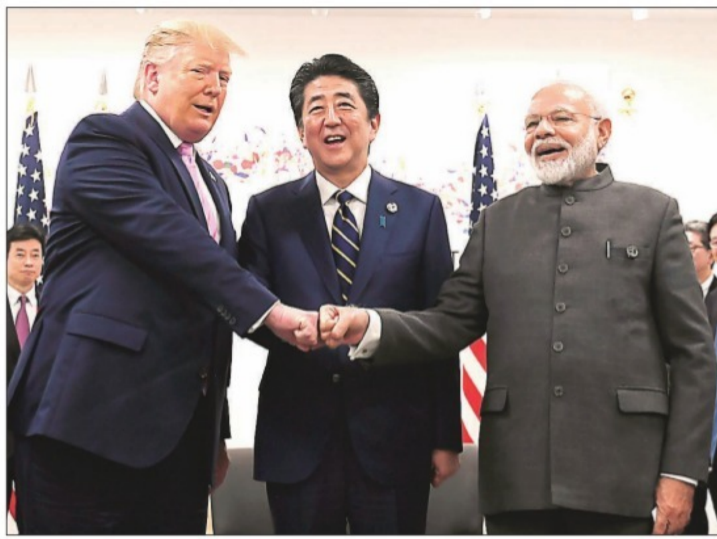
Prime Minister Narendra Modi, US President Donald Trump and Japanese Prime Minister Shinzo Abe share a fist bump during their meeting on the sidelines of the G-20 summit in Osaka, Japan, Friday.

On Friday, the bilateral meeting between the two leaders went slightly beyond the allotted 40 minutes, with Foreign Secretary Vijay Gokhale telling reporters later that both sides "aired their concerns", and agreed that their trade ministers, or representatives, will meet soon to sort out these issues. Trump, who had targeted India in a tweet for "very high tariffs" barely 24 hours ago, CONTINUED ON PAGE 2