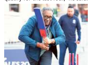
Lloyd said West Indies was capable of making the semifinals. "From what I've seen so far, though, I think the West Indies do possess enough to qualify for the last four," he said.

The current West Indies team has the firepower to cause a few upsets, said Clive Lloyd. Lloyd, who captained the West Indies in three World Cups, said: "I thought the West Indies were quite clinical against Pakistan. They used the pitch to their advantage in the sense that it had a bit of life and they put pressure on Pakistan. I'm sure they will upset a few of the big boys if they play like that."