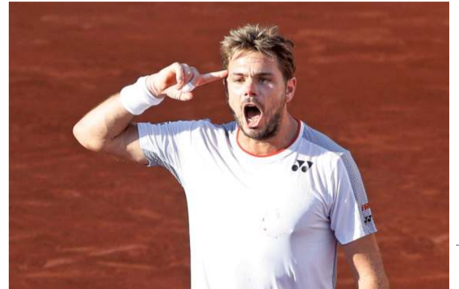
Gung ho: Stan Wawrinka needed five hours and nine minutes to overcome Stefanos Tsitsipas.

Women: 7-Sloane Stephens (USA) bt 19-Gabrine Muguruza (Esp) 6-4, 6-3; 31-Petra Martic (Cro) bt Kaia Kanepi (Est) 5-7, 6-2, 6-4; Marketa Vondrousova (Cze) bt 12-Anastasija Sevastova (Lat) 6-2, 6-0; 26-Johanna Konta (GBR) bt 23-Donna Vekic (Cro) 6-2, 6-4.