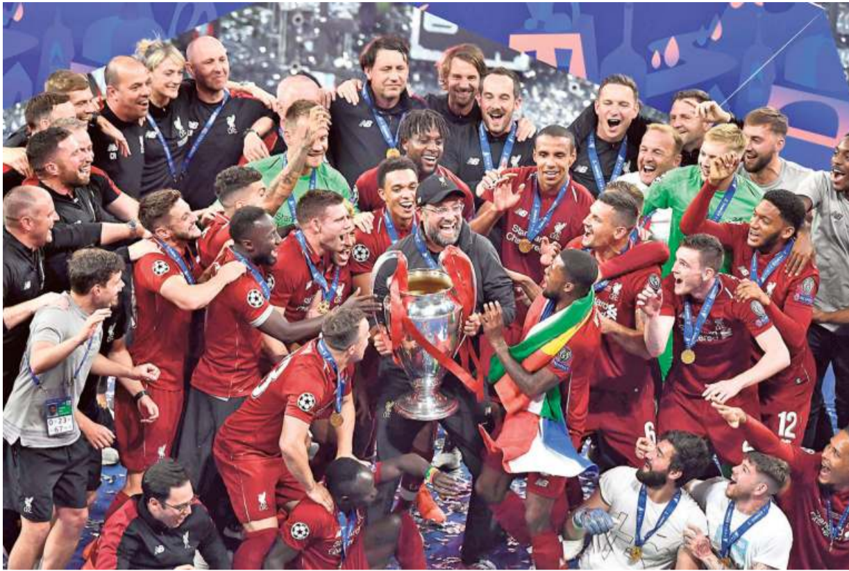
Cup that matters: Manager Jurgen Klopp leads the celebrations after engineering Liverpool's return to continental glory.

Spurs put Liverpool under real pressure in the latter stages as Dele Alli headed over and Son Heung-min and Moura forced impressive saves from Alisson, who also pulled off his best effort to