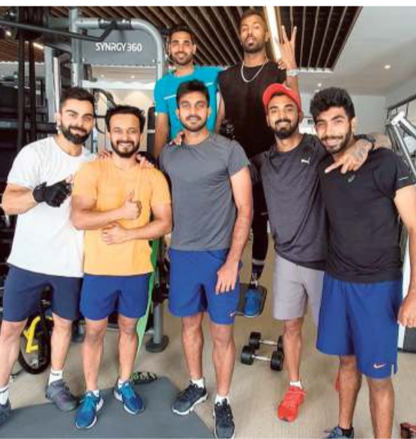
In holiday mood: Virat Kohli and some of his team-mates hit the gym on their off-day in Southampton.

He has also started bowling in the nets, something he was not doing during the IPL due to his dodgy hamstring.