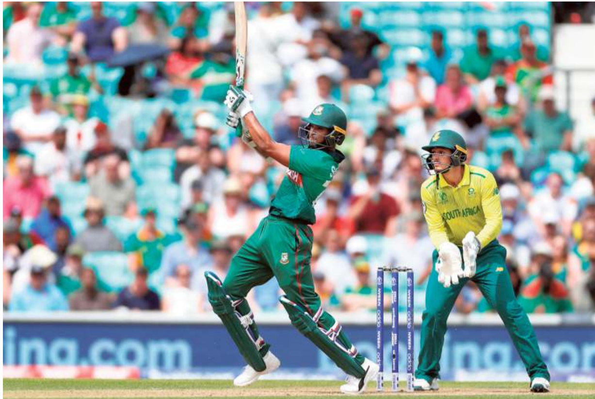
Star-of-the-match: Shakib Al Hasan complemented his impressive half-century with some productive spin bowling.