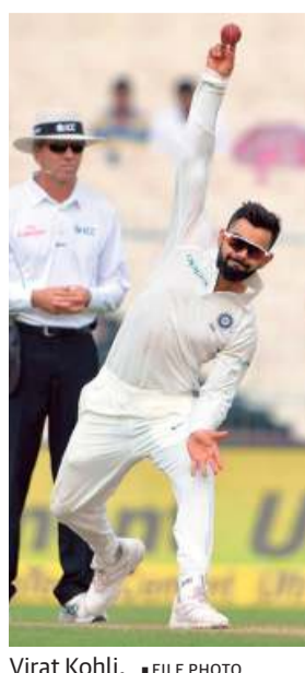
Virat Kohli. • FILE PHOTO