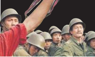
PEOPLE'S DAILY, COMMUNIST PARTY MOUTHPIECE

As a vaccination for the Chinese society, the Tiananmen incident will greatly increase China's immunity against any major political turmoil in the future