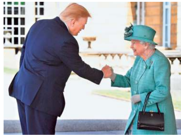
A royal welcome: U.S. President Donald Trump with Britain's Queen Elizabeth II at Buckingham Palace on Monday.

But the day began with controversy as, even before his plane touched down, the President lambasted London Mayor Sadiq Khan, who has been highly critical of the