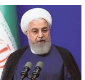
Iranian President Hassan Rouhani.

"The party that has left the negotiating table, the party that has trampled the pact must return to a normal" behaviour, Hassan Rouhani said. "If the enemy truly realises that the path it took was wrong, that will be the day to sit at the negotiation table and fix any issue," he added.