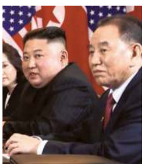
North Korea's leader Kim Jong-un with envoy Kim Yong-chol.

newspaper Chosun Ilbo had said Mr. Kim Yong-chol, the leader's right-hand man and a counterpart of U.S. Secretary of State Mike Pompeo before the failed summit, had been sent to a labour camp, citing an unidentified North Korean source.