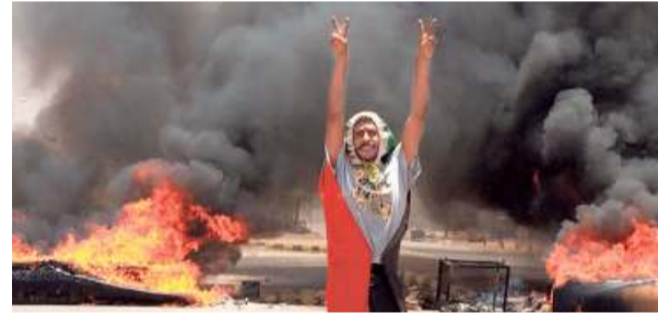
Violent interruption: A protester in front of burning tyres near Khartoum's Army headquarters on Monday.

The Central Committee of Sudanese Doctors, which is close to the protesters, up-