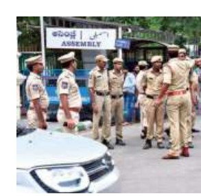
Policemen outside the Assembly in Hyderabad on Thursday.

The decision came hours after they met him and sought merger of their group