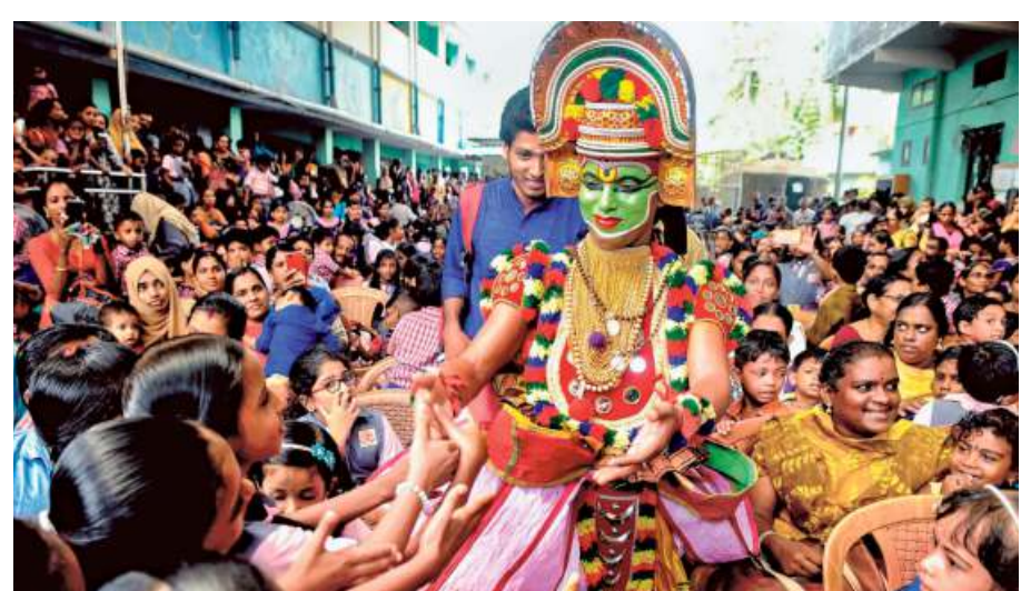
An 'Ottamthullal' artiste greeting students at the Talap Mixed Upper Primary School in Kannur on the school reopening day, Thursday.