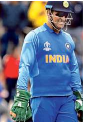
M.S. Dhoni and the gloves with the dagger insignia.