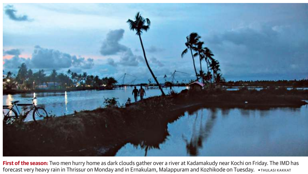
First of the season: Two men hurry home as dark clouds gather over a river at Kadamakudy near Kochi on Friday. The IMD has forecast very heavy rain in Thrissur on Monday and in Ernakulam, Malappuram and Kozhikode on Tuesday.

NPP first to become national party from N-E GUWAHATI The Election Commission on Friday declared the National People's Party led by Meghalaya Chief Minister Conrad K. Sangma as a national party. This made the NPP, formed by his father and former Speaker Purno A. Sangma in 2013, the first from the Northeast to earn the tag. NEWS ▶ PAGE 12