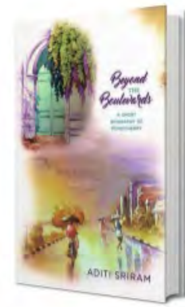
IN BEYOND THE BOULEVARD ADITI SRIRAM Aleph 201 pages ₹ 399

IN MOST tourists' experience, Puducherry is as pretty as a picture postcard — and as flat as one, too. The typical tourist experience of the little coastal town, also a Union Territory, is limited to the brightly-painted, bougainvillea-shaded rues of the French Quarter. You stroll through the streets, have a Franco-Tamil meal at one of the delightful little restaurants, buy a chipped, faded objet d'art from one of the antique shops, and, finally, wind your way towards the beachside boulevard to watch the sun set.