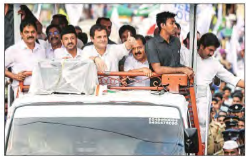
Congress president Rahul Gandhi at a roadshow in Wayanad on Friday.

Reviving his attack on Prime Minister Narendra Modi after