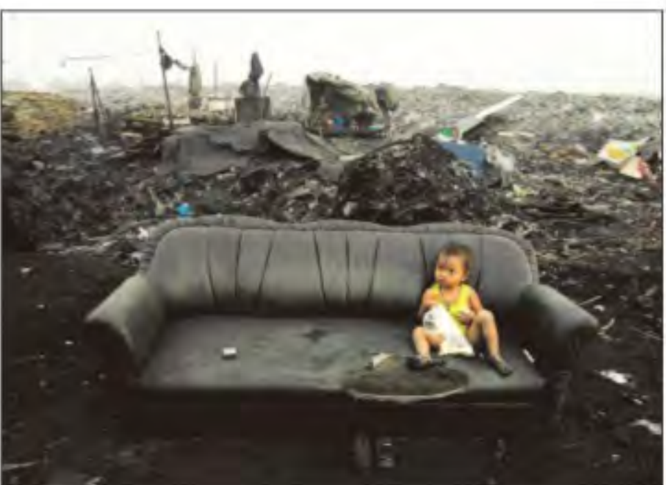
A child at a garbage dump in Tondo, Philippines.

But at a time when the world is awash in such plastic, some ex-