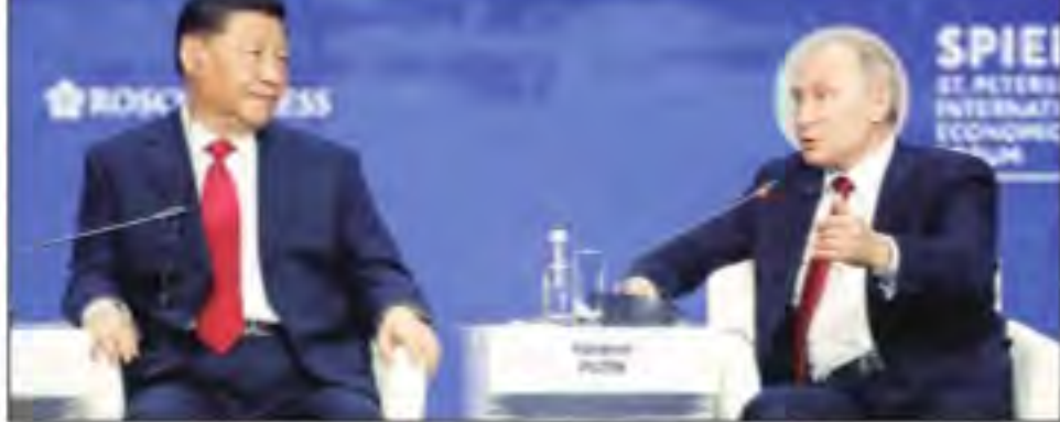
Russian President Vladimir Putin (right) along with Chinese President Xi Jinping at the St. Petersburg International Economic Forum in St. Petersburg, Russia, Friday.

His broadside, at an economic forum in St Petersburg on the same platform as Xi, was a clear show of unity with China at a time when Beijing is locked in a trade war with Washington and Moscow's own ties with the