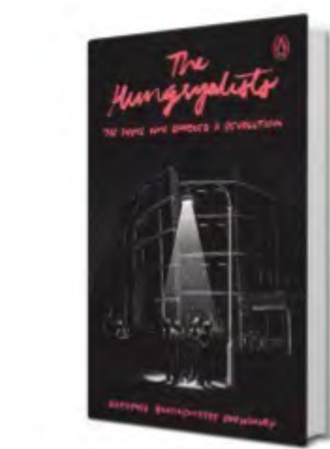
THE HUNGRYALISTS: THE POETS WHO SPARKED A REVOLUTION MAITREYEE BHATTACHARJEE CHOWDHURY Penguin Random House 198 pages ₹ 599

this "failure", if indeed failure it was, as well as the enduring afterlife of a movement that had all the ingredients of a successful potboiler, with large dollops of love, sex, drugs, intrigue, backstabbing, madness, violence and politics (the Naxalite movement followed close on the heels of the Hungryalists and the split in the