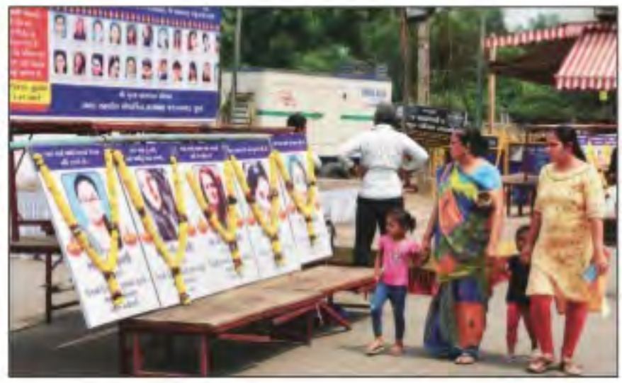
People walk past pictures of the victims of the Surat fire tragedy on Friday. The fire, which broke out on May 24, killed 22 students at a coaching centre in the city.

pending. "We contacted the Twitter and the handle was verified and restored. Its followers have also been added back," the official said. "#ChinarCorps Twitter handle is fully functional & verified. Thank you all... #AwaamArmyConnect #TerrorismFreeKashmir @adgpl..." it said.