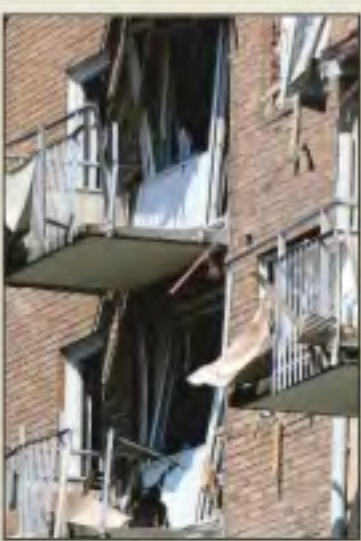
After the blast