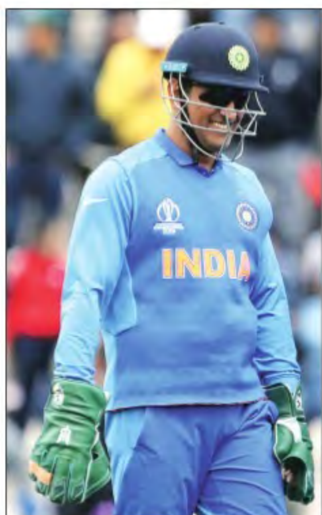
ICC objected to Dhoni's use of an army insignia on his wicketkeeping gloves.