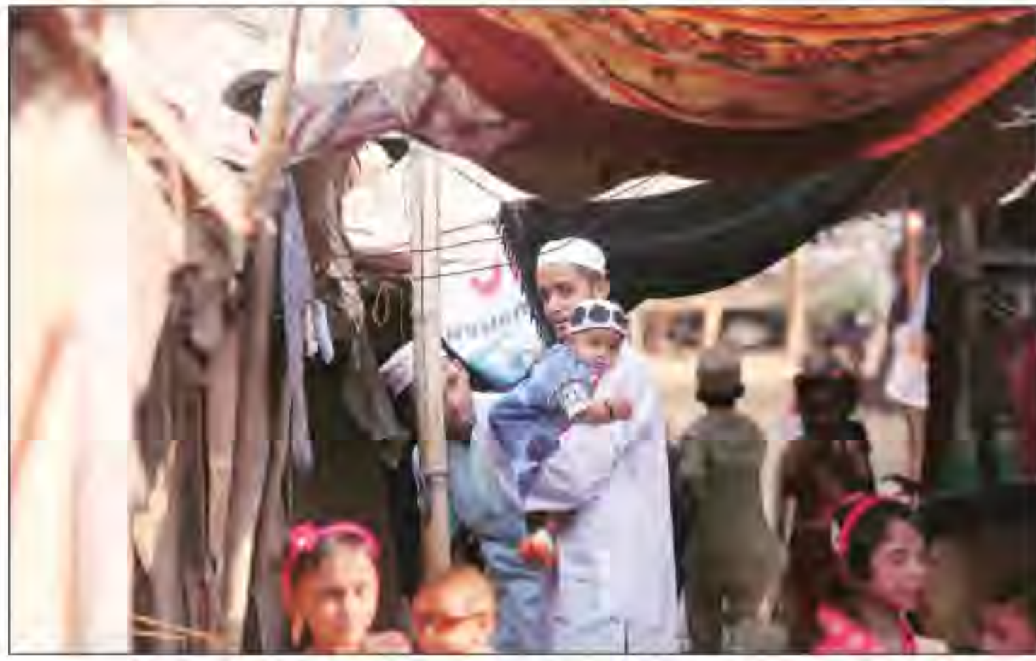
The camps at Kalindi Kunj (above) and Okhla.

"Children are the worst hit... they get dehydration, diarrhoea and rashes. In the last month, I had to take my two children, aged three and five, to the dis-