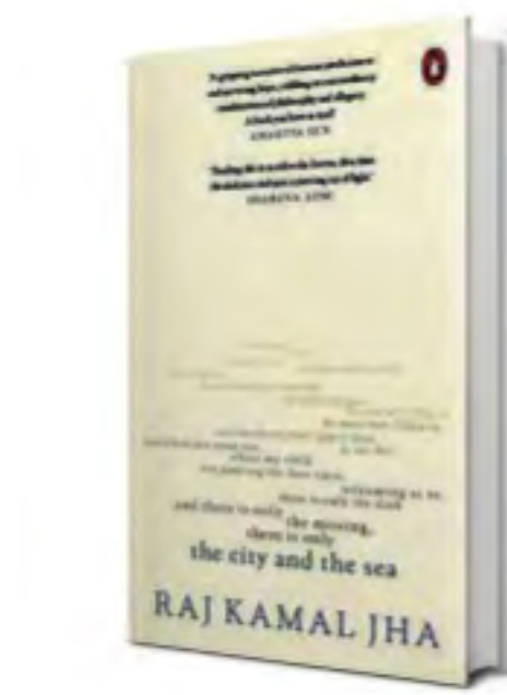
THE CITY AND THE SEA RAJ KAMAL JHA Penguin Hamish Hamilton 267 pages ₹ 499

speakable. And when what can't be said is written, you don't speak about it, instead you cover it with... mostly with deceptive contradictions and inversions. The first of them is the protagonist, whom the reader would vaguely identify with Nirbhaya, is inverted to an implausible mother, vacationing on the Baltic coast of Germany. She has come out of a coma in a hospital and it is in her dream about the future that she is transported to a German city by the sea. While she abandons the city for the sea, in the city a boy is searching for his lost mother. One of the perpetrators of the crime, the juvenile, is also seen journeying through the labyrinthine city.