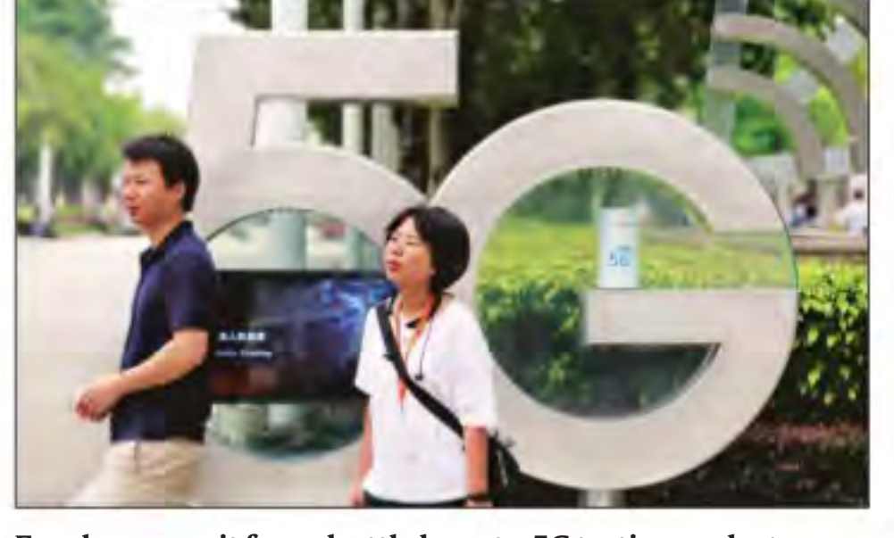
Employees wait for a shuttle bus at a 5G testing park at Huawei's headquarters in Shenzhen, China.

GSMA has already voiced concerns about the consequences of a full ban on Huawei, whose products are widely purchased and used by operators in Europe. Huawei is one of the key supporters of the lobby group, several industry sources said. The 55-billion-euro estimate