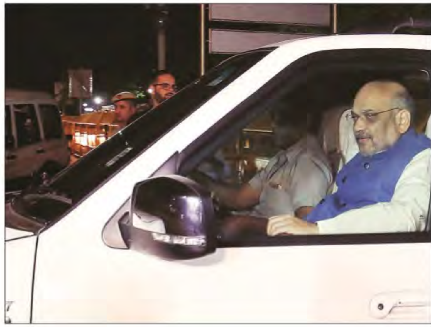
Home Minister Amit Shah comes out of Defence Minister Rajnath Singh's residence, after a meeting of key ministers, in New Delhi, on Friday.

AT A recent World Environment Day event, Gajendra Singh Shekhawat, heading the new Jal Shakti Ministry, spoke of how environmental degradation has much to do with straying from Indian culture. He lamented how a country that until two-three generations ago revered the environment in the form of jal (water), vaayu (air) and bhoomi (earth) now has to observe World Environment Day like other countries. His Cabinet colleague from the Environment Ministry, Prakash Javadekar, gave a more contemporary reference. Recalling how he too didn't have access to a toilet as a child, and how over the years human waste has contaminated our water bodies, he repeated the lyrics of the Bollywood song ' Ram teri ganga maili ho gayi paapiyon ke paap dhote dhote '.