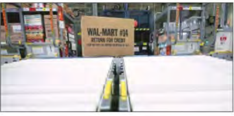
A box of merchandise is unloaded from a truck and sent along a conveyor belt at a Walmart Supercenter in Houston.

Amazon offers a similar service in certain cities, dropping off packages inside homes, garages or car trunks. But the service is not