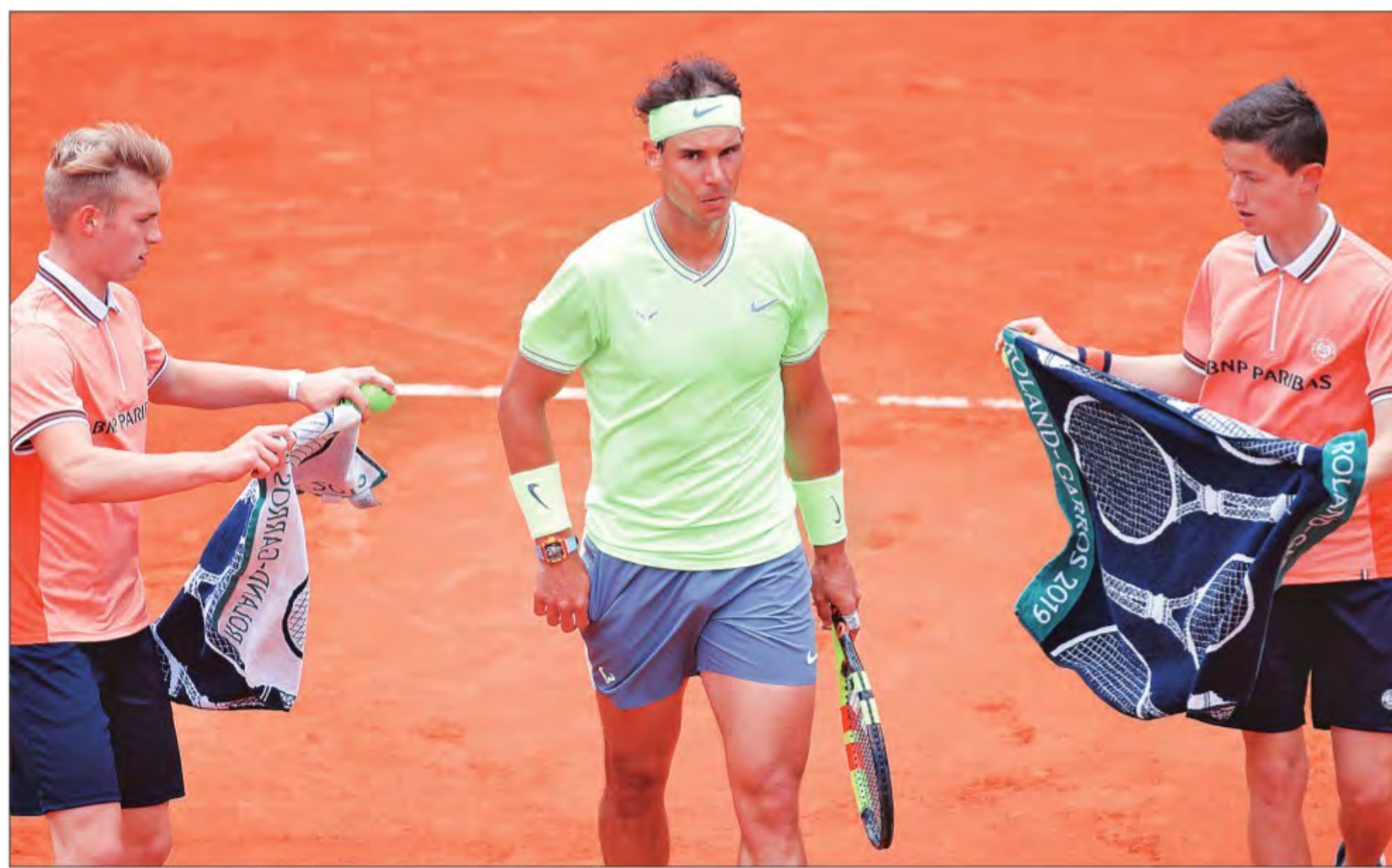
Rafael Nadal beat Roger Federer 6-3, 6-4, 6-2. A tally of just nine games meant it was Federer's heaviest Grand Slam loss since managing only four against Nadal in 2008.

"It's just really complicated, you know," Federer said. "So you're trying to see how much can you do... or you cannot do. Are you playing