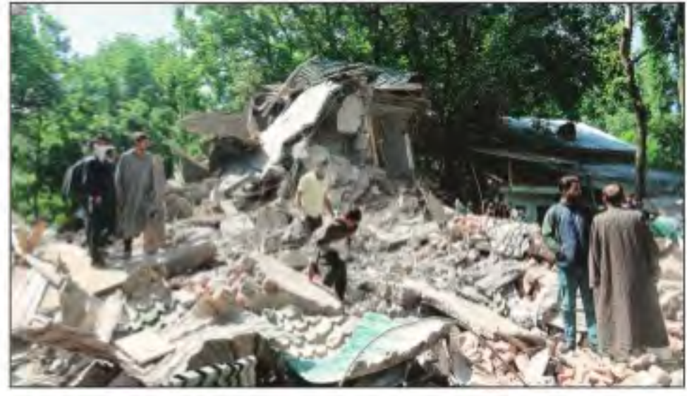
A house damaged during the encounter in Kashmir's Pulwama district.

"In the ensuing encounter, two listed terrorists and two SPOs who had recently deserted (the force) and become members of the proscribed terrorist