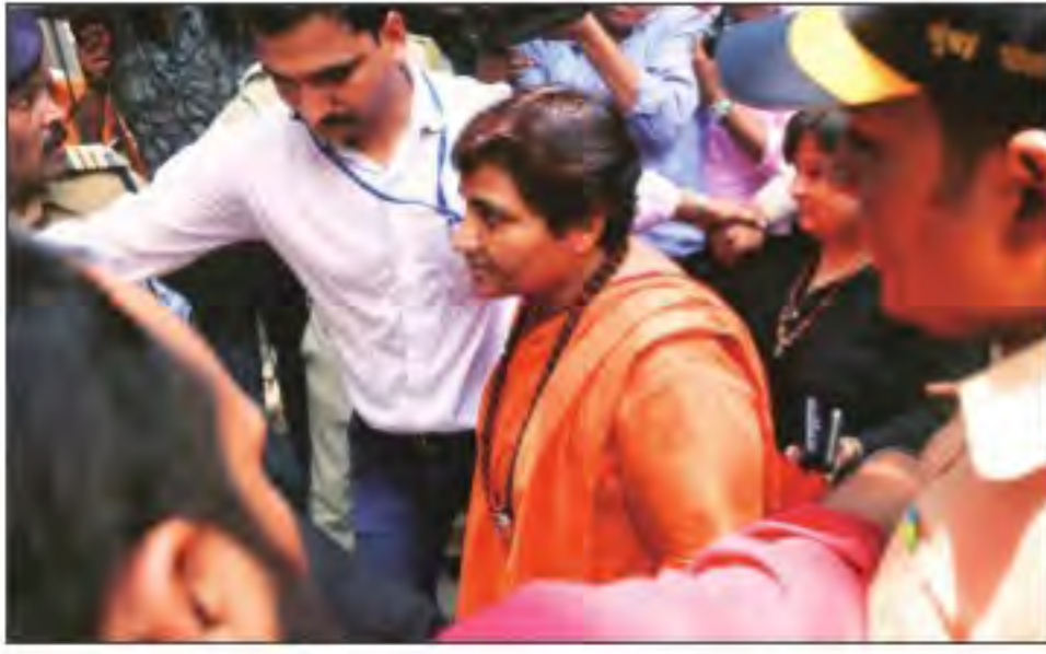
Pragya Singh Thakur at the special NIA Court.

APPEARING IN court for the first time since the trial in the 2008 Malegaon blast case began in December, accused and BJP MP Pragya Singh Thakur had one answer for the two questions she was asked: "I do not know". Thakur chose to stand through most of the proceedings, complained about the seating arrangement and the cleanliness of the court, and wondered why she was called at all.