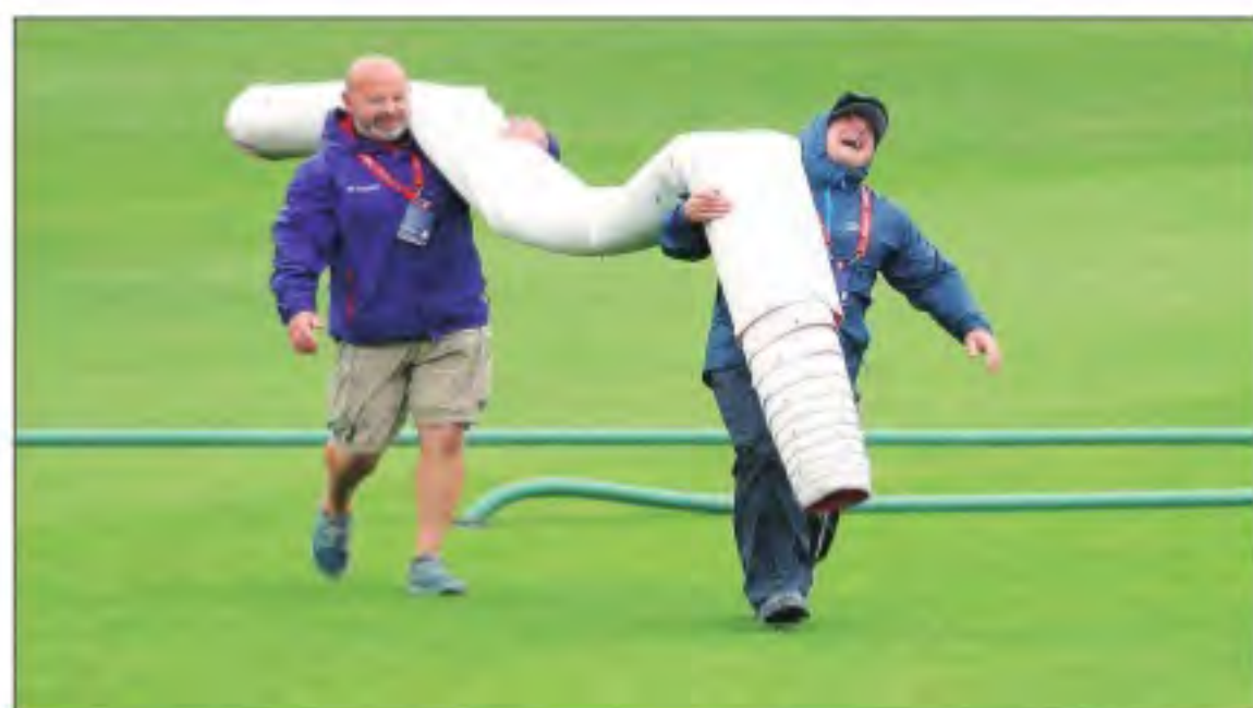
EXTRA COVER Sophia Gardens' groundstaff carry rain cover as it drizzles in Cardiff on Friday. England face Bangladesh here on Saturday.