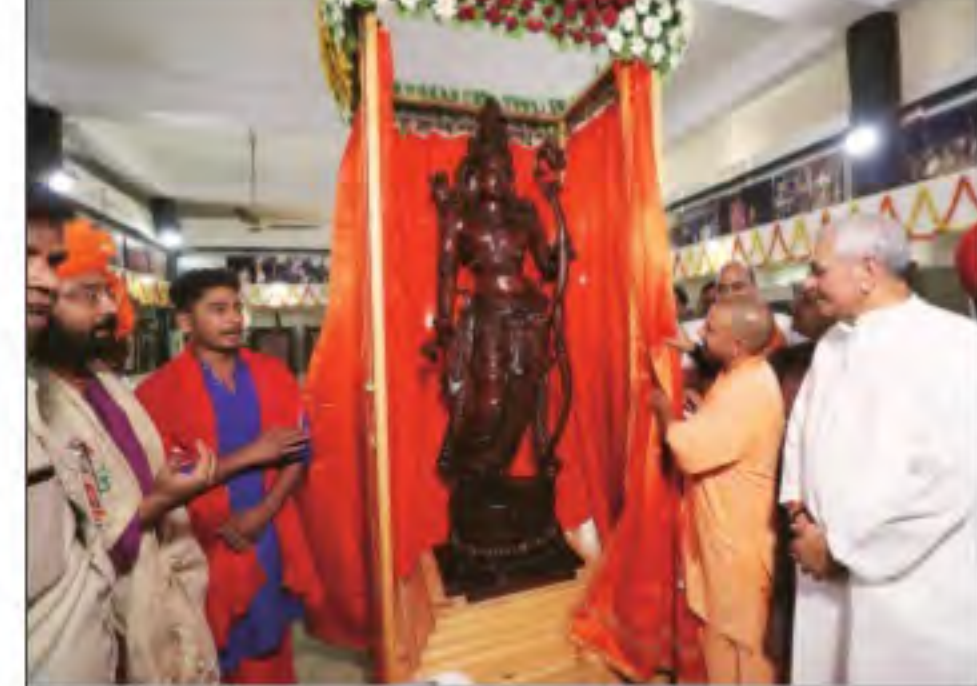
UP Chief Minister Yogi Adityanath unveils a statue of Lord Ram in Ayodhya on Friday.

He claimed that it was only after Prime Minister Narendra Modi came to power that work was undertaken to give Ayodhya its "identity", right