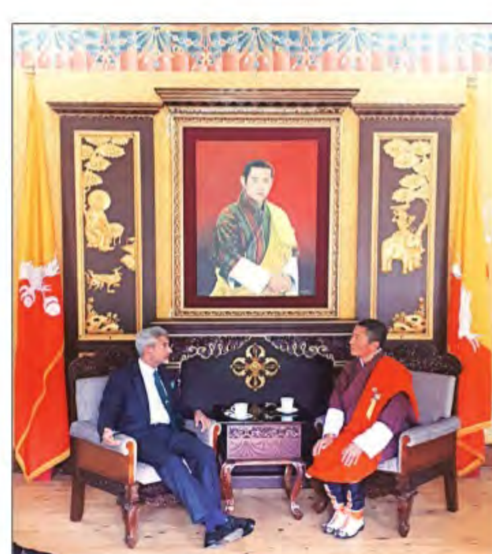
Minister of External Affairs Subrahmanya Jaishankar meets Prime Minister of Bhutan Lotay Tshering in Thimpu on Friday.