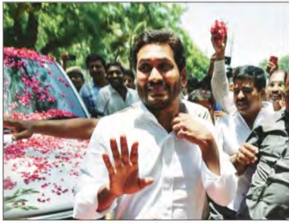
Jagan said ministers will get two-and-half-year tenures.

Jagan told the MLAs that the five deputy CMs will represent SCs, STs, OBCs, minorities and the Kapu community. The Kapu community, which had backed the TDP in 2014 shifted to Jagan in the state elections, hence the representation in the Cabinet.