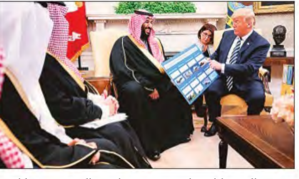
President Trump discussing weapon sales with Saudi crown prince Mohammed bin Salman last year.

Multiple reports by human rights groups over the past four years have singled out the weapons as being used in airstrikes on civilians. One attack, on a Sana funeral home in October 2016, led the Obama administration to suspend bomb sales to the Saudi-led coalition in Yemen.