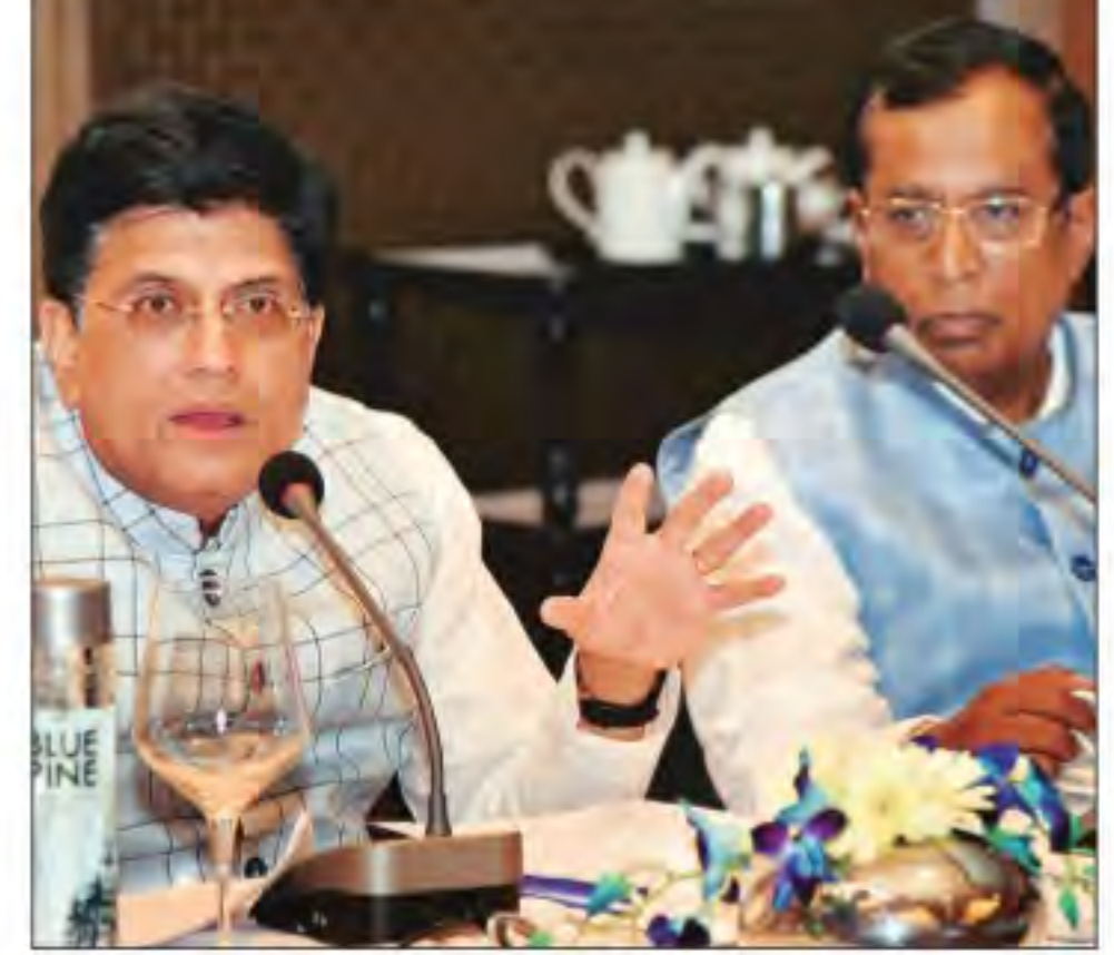
Union Commerce and Industry Minister Piyush Goyal along with Minister of State for Commerce Som Parkash at a meeting to discuss issues related to export credit, in New Delhi on Friday.

He has also told the Federation of Indian Export Organisations (FIEO) to submit a report on issues like shifting from subsidies to "cheaper" availability of loan in foreign currency to exporters and ECGC enabling a credit guarantee to cover foreign currency lending to and extending export factoring for micro, small and medium enterprises. Other issues in focus include simplification of banking procedures for exports and the EXIM bank's provision of refinancing in foreign