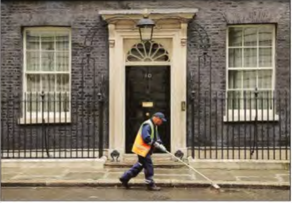
Outside 10 Downing Street in London, Friday.

BRITISH PRIME Minister Theresa May stepped down as leader of the governing Conservatives on Friday, officially triggering a contest to replace her that could see her party embrace a tougher stance on Brexit. May announced she would step down last month after failing to deliver Britain's departure from the European Union on time. She will continue to work as PM until her party elects a new leader, a crowded race that will be defined by Brexit and competing approaches on how to deliver Britain's biggest foreign policy shift in more than 40 years.