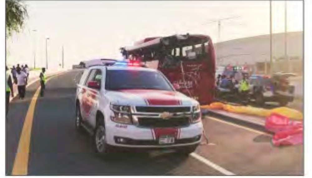
The aftermath of the bus crash in Dubai on Friday.

With both sides showing little enthusiasm for talks, this impasse has become a worrisome matter for all the other stakeholders.