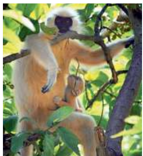
A richer habitat: A baby golden langur with its mother in Guwahati zoo.

On June 5, the district authorities launched a ₹27.24-lakh project under the MGNREGA to plant guava, mango, blackberry and other fruit trees to ensure that the resident golden langurs of the 17 sq.km. Kakoijana Reserve Forest do not have to risk their lives to find food. Several golden langurs have died due to electrocution