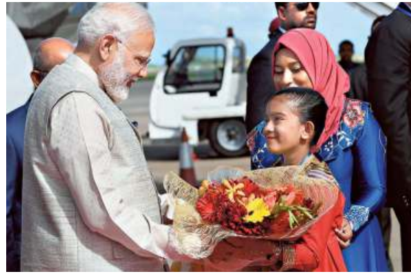
First stop: Prime Minister Narendra Modi being received at the Male airport on Saturday.

"State sponsorship of terrorism is the biggest threat the world is facing today,"