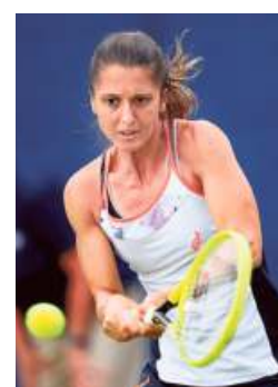
Gatto-Monticone. ■ REUTERS