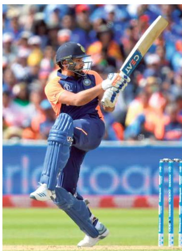
Swinging away: Rohit Sharma's fine form continued as he notched up his third century of the tournament.

Rohit Sharma, the team's vice-captain and a centurion to boot, had his take on the issue: "It is a tricky thing. Some of the guys heard, some of the guys didn't. There are a lot of thoughts that come around, some guys thought he (Roy) nicked it, some felt he didn't. If you are lucky you have the decision going your way. The captain is always under pressure. We, as a team, don't want to look too much into it." The opener also explained