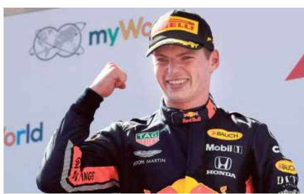
Max again: Verstappen took the chequered flag. ■ REUTERS

Hamilton remains in front, 31 clear of Finland's Bottas after nine of 21 races.