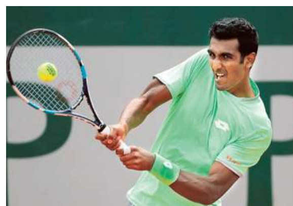
Looking ahead: With injury issues behind him, Prajnesh Gunneswaran goes into Wimbledon feeling good.

The Indian, however, faces a stern test first up against the big-serving Canadian Milos Raonic who made the finals