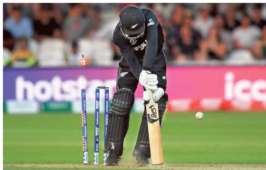
Got him! Lockie Ferguson has no clue to this Mitchell Starc special.