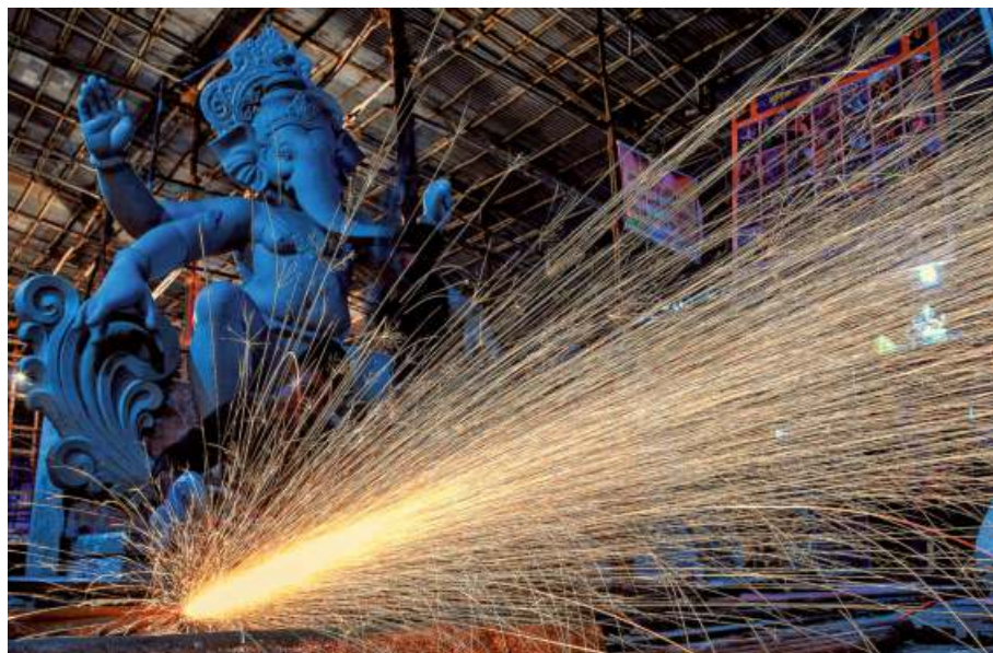
The making of Ganesha idols is on in full swing at a workshop in Parel, Mumbai. The torrential rain last week had hampered the work for a brief period. Ganesha Chaturthi falls on September 2.