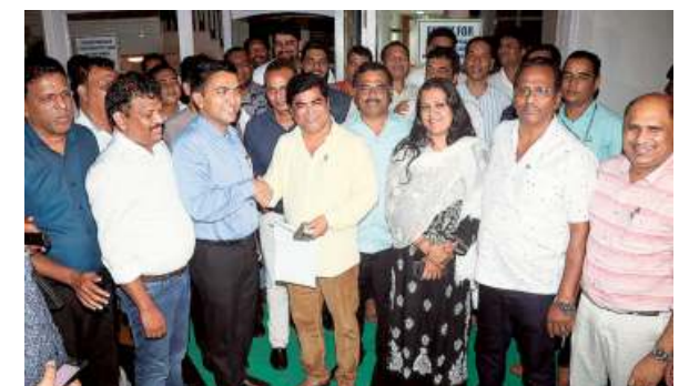
Another shocker: Goa CM Pramod Sawant greeting former Opposition leader Chandrakant Kavlekar and other Congress MLAs in Porvorim on Wednesday.