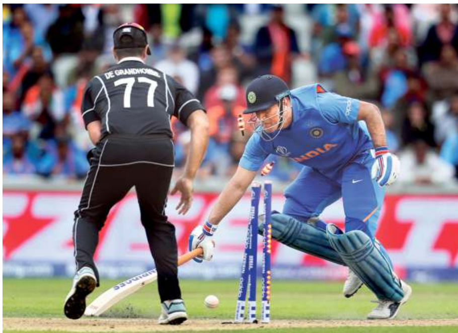
When the nation gasped: M.S. Dhoni gets run out during the World Cup semifinal between India and New Zealand at Old Trafford in Manchester on Wednesday.

Chasing New Zealand's 239 for eight, India stumbled right at the start, collapsing to 24 for four in 10 overs as seamers Trent Boult and Matt Henry (three for 37) bowled incisive spells. Rohit Sharma, Virat Kohli, K.L. Rahul and Dinesh Karthik fell quickly and the remainder of the clash was more about hitching hopes on Ravindra Jadeja's fiery 77 and his 116-run seventh-wicket partnership with M.S. Dhoni, who scored 50.