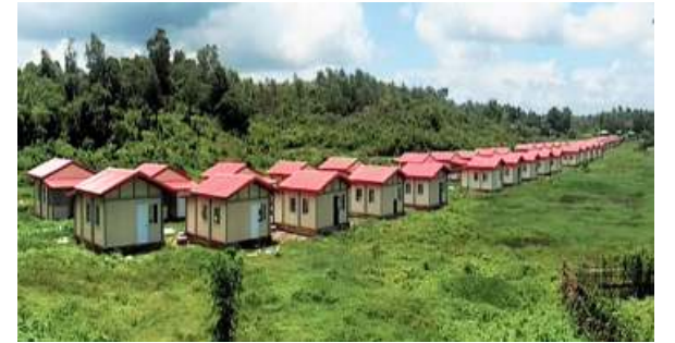
Friendly gesture: Pre-fabricated houses built by India at Nan Thar Taung in Myanmar.