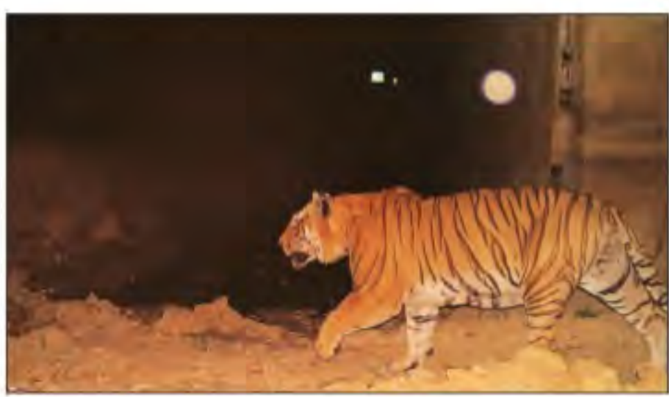
T1 spotted using an underpass at night.