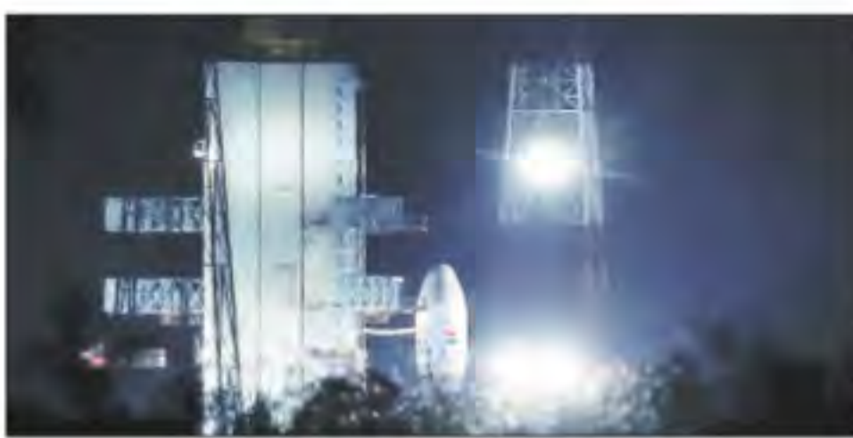
GSLV-MkIII on the Sriharikota launch pad

be announced later." It was not clear immediately how soon that new launch date could be. ISRO officials indicated that it could take up to a few days to assess the seriousness of the problem. It could rule out another attempt at the launch in the current window of opportunity which is available only until Tuesday (July 16). The next launch date could be months later. The countdown to the launch was stopped at 56 minutes ahead of the scheduled time