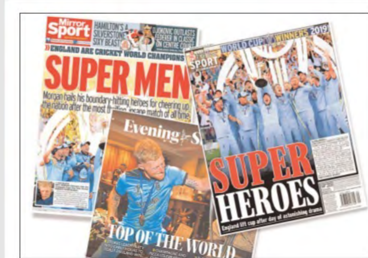
The English newspapers, as is their wont, were overflowing with superlatives, celebrating England's maiden World Cup triumph.

As adorable as the Kiwis have been, the England team made a massive point even as UK negotiates its Brexit ramifications. The multi-cultural team was hailed by many — Morgan had represented Ireland in international cricket before switching to England, Ben Stokes, who played the heroic knock in the final, was born in New Zealand; Jason Roy,