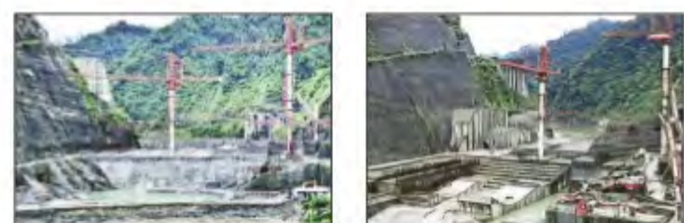
The hydel power project site in 2011 (left) and 2019