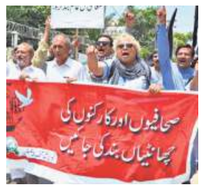
Protesters holding a banner that reads: 'Stop sacking journalists', in Peshawar.

Ad budget slashed Journalists and press freedom advocates say that the Pakistani military is pressuring media outlets to quash critical coverage while the newly elected government is slashing its advertising budget.