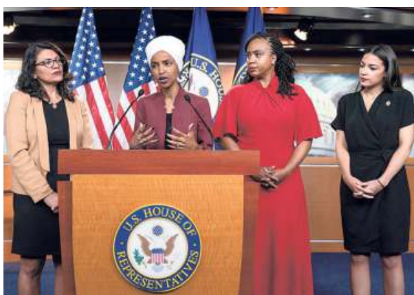
(From left) Rashida Tlaib, Ilhan Omar, Ayanna Pressley and Alexandria Ocasio-Cortez in Washington.

"We cannot allow these hateful actions by the President to distract us from the