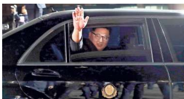
Comfort trip: A file photo of Kim Jong-un waving from a car in the truce village of Panmunjom, South Korea.

High-end Western goods are making their way to North Korea's elite through a complex system of port