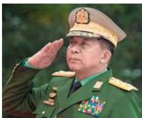
Min Aung Hlaing

"We remain concerned that the Burmese govern-