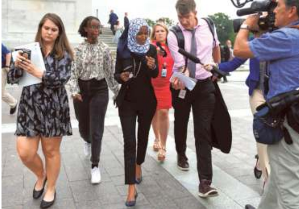
Making a point: Minnesota Democratic representative Ilhan Omar speaking with reporters in Washington on Tuesday.

It was the Democrats' response to Mr. Trump's attacks