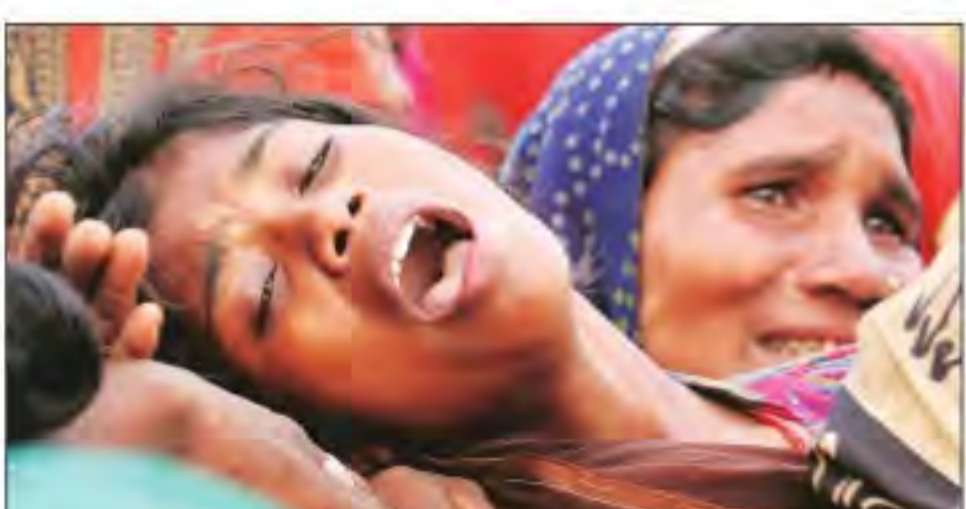
Family members of those killed in Umbha village. Vishal Srivastav

A day later, with another death in hospital and all the victims belonging to the Gond community, the divide has widened