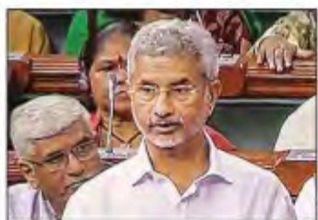
S Jaishankar in Lok Sabha on Thursday.

Earlier, External Affairs Minister S Jaishankar, who as Foreign Secretary had played a key role in taking the matter to the ICJ, made a statement in both