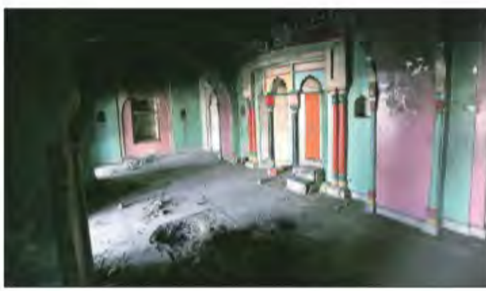
A mosque in Shamli district from where Islam (65) was chased and killed on September 8, 2013. Gajendra Yadav

THESE ARE among the several glaring holes The Indian Express found in the Uttar Pradesh government's prosecution cases in 10 murder cases filed on the violence that swept through Muzaffarnagar in 2013, killing at least 65 people. Based on the testimonies, and holding that witnesses, mostly relatives of those killed, had turned hostile, the courts acquitted all in the 10