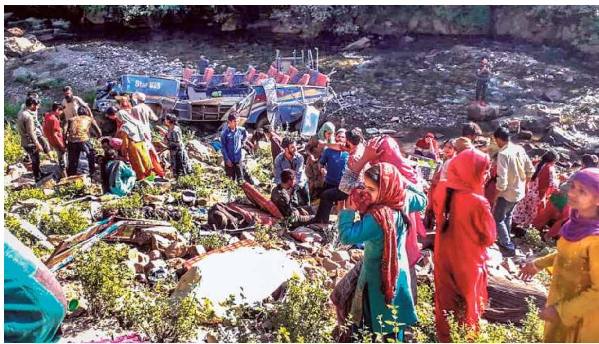
Help at hand: A rescue operation under way after the accident in Kishtwar on Monday.

CONTINUED ON ▶ PAGE 12 THREE KILLED IN SHIMLA ▶ PAGE 9