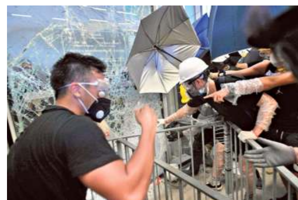
Under siege: Protesters trying to smash a glass door at the government headquarters in Hong Kong on Monday.

"Some radical protesters stormed the Legislative