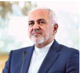
Mohammad Javad Zarif says EU measures are not enough to save the deal.

"We had previously announced this and we have said it transparently what