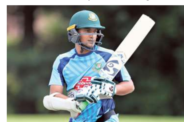
Vital cog: Bangladesh will hope Shakib Al Hasan's form with both bat and ball continues in the game against India.

be, may be not, but let's see. Countering spin: If we look at their stats in last few years, both Indian spinners have done well. We just can't think that what England did (hammering the spinners), we will do the same and get success. We will stick to our plans and our batting has been good through the tournament. We will play it our way. Shakib's brilliance: Shakib (Al Hasan) has been doing whatever he can do, be it batting, fielding or bowling. He has been our best performer in this World Cup. We still have two matches left and hopefully he will keep doing whatever he has done so far and finish on a good note.