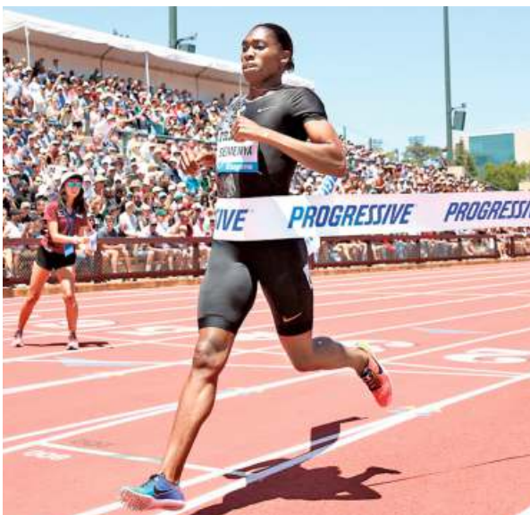
Brooking no challenge: Caster Semenya cantered to victory in the 800m in the Prefontaine Classic on Sunday.

"If I am not running 800 metres, I'm not running in the World Championships," said the 28-year-old South African. "No 1,500 (metres), nothing. I am just going to