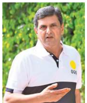
Prakash Padukone.

Besides, the meeting also decided to jointly award Pankaj Advani (billiards and snooker) and Bajrang Punia (wrestling) with the SJFI