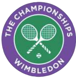
AGENCE FRANCE-PRESSE LONDON

Djokovic and Wawrinka begin with straight-set wins; Raonic too good for Prajnesh