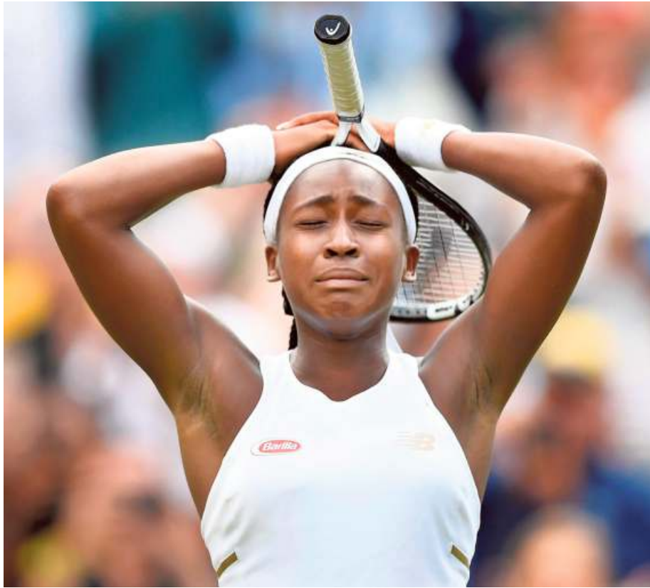
What a start! Cori Gauff is overcome with emotion after her incredible win.

Fourth seed Kevin Anderson, runner-up to Djokovic in 2018, eased into the second round beating Pierre-Hugues Herbert of France 6-3, 6-4, 6-2.