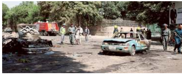
Security personnel at the site of a bomb explosion in front of Kabul University on Friday.