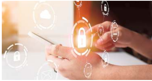
Cyber threat: The tool can access history of a target's location data, archived messages and photos.

"NSO's products do not provide the type of collection capabilities and access to cloud applications, services, or infrastructure as listed