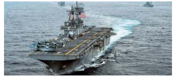
In troubled waters: A file photo of USS Boxer.

Mr. Trump on Thursday said that the vessel took action after the drone ignored commands to stay away and came too close to it.