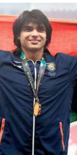
Neeraj Chopra.