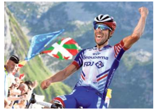
Coming good: Thibaut Pinot led a French one-two.

Defending champion Geraint Thomas lost 35 seconds after being dropped by Pinot at the death, while his Ineos co-captain Egan Bernal finished a few seconds behind the winner at the first of seven summit fin-