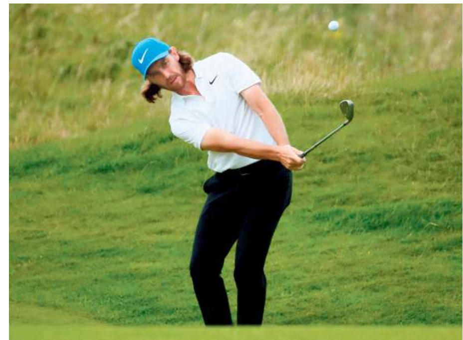
The swing factor: Tommy Fleetwood stormed up the leaderboard with a five-under on Saturday.

1. Shane Lowry (-8 in third round, -16 overall); 2. Tommy Fleetwood (-5, -12); 3. J.B. Holmes (-2, -10); 4. Brooks Koepka (-4, -9) and Justin Rose (-3, -9); 6. Rickie Fowler (-5, -8) and Lee Westwood (-1, -8); 72. Shubhankar Sharma (+6, +6).