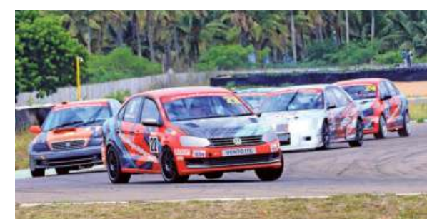
Setting the pace: Volkswagen leads the pack in the ITC saloon category.