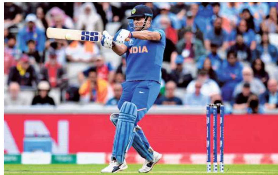
Crucial call: M.S. Dhoni, no doubt, will want to time his retirement to perfection.

selectors? They would ideally want Dhoni to take a bow as they are keen to look ahead and nurture some youngsters. Technically,