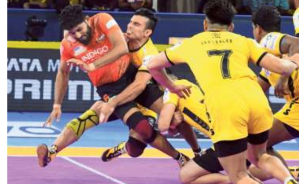
Action-packed: A U Mumba raider tries to wriggle out of the Titans' grasp.

An all-round display by U Mumba, which scored the first all-out of the game through Abhishek Singh's raid, powered ahead 13-6. U Mumba held on to its