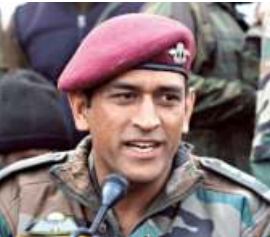
M.S. Dhoni.

A top BCCI official confirmed the development. "Dhoni has made himself unavailable for the tour of West Indies as he will be spending two months with