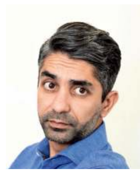
Abhinav Bindra. • FILE PHOTO

"The youth of today are far more confident. I think that makes a lot of different because it gives them a lot of