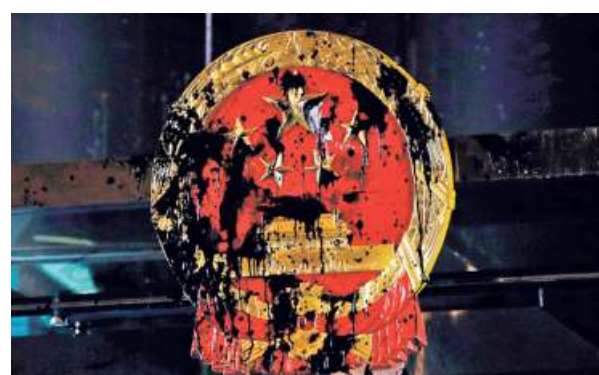
Sending a message: A defaced Chinese national emblem outside the Liaison Office in Hong Kong on Sunday.

wearing masks, defied police orders and marched beyond the official endpoint of a rally that took place earlier in the day as they made their way towards the Liaison Office.