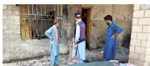
The hospital that was targeted by a woman suicide bomber.

Four unidentified armed men on two motorbikes