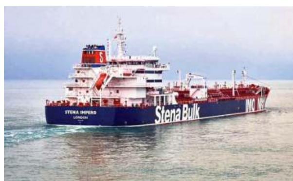
Tough stance: Britain has called Iran's capture of the Stena Impero in the Strait of Hormuz on Friday a "hostile act".

Britain's junior Defence Minister Tobias Ellwood did not rule out the possibility of targeting Tehran with sanctions in response. "Our first and most important responsibility is to make sure that we get a solution to the issue