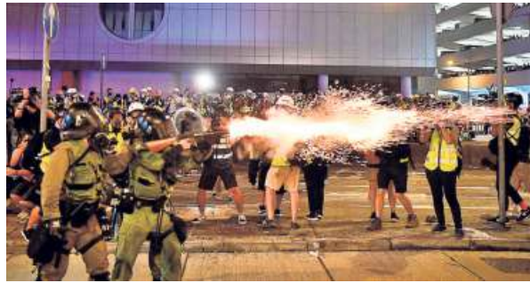
Crowd control: A policeman firing a tear gas shell at protesters in Hong Kong late on Sunday.

"Actions by some radical demonstrators have affected