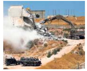
Israeli forces demolishing a building on Monday.

One man yelled "I want to die here", after being forced