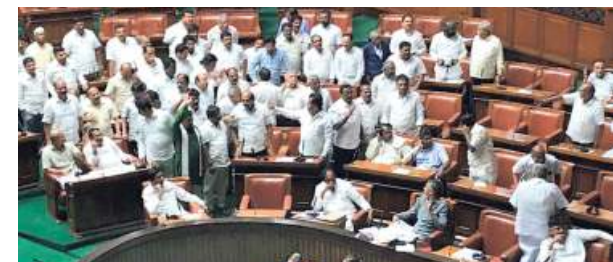
No solution yet: Members of the ruling coalition request the Speaker to postpone the proceedings.

Earlier in the evening, the Speaker served notice on the 15 rebel MLAs, asking them to