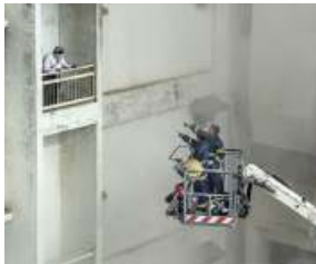
Firefighters using a crane to rescue a trapped MTNL employee in Mumbai on Monday.

Anxious MTNL employees stood on the terrace for close to three hours before they were rescued with ladders. The fire brigade de-