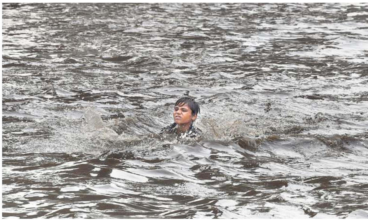
A child makes the most of a waterlogged G.T. Karnal Road after heavy rain in New Delhi on Monday. (SEE ALSO PAGE 2)