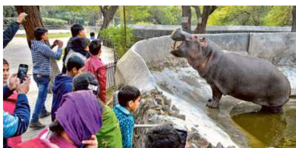
A zoo official said that the deaths were mainly due to old age and infighting among animals.

"After preparing the document which will have details of each animal that died, its age and cause of