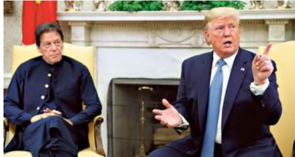
Offering help: U.S. President Donald Trump with Pakistan Prime Minister Imran Khan in the Oval Office on Monday.

"If I can help, I would love to be a mediator. If I can do anything to help, let me know," Mr. Trump said. He said Indian Prime Minister Narendra Modi broached the subject during their meeting in Osaka, Japan, last month. "I was with