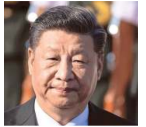
Chinese President Xi Jinping

China's military on Wednesday signalled that ties with India were improving, but warned the U.S. that it should not test Beijing's one-China policy over Taiwan.