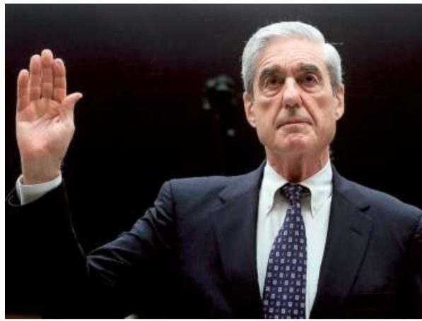
Straight talk: Robert Mueller said his inquiry was conducted in "a fair and independent manner".

REUTERS WASHINGTON Former U.S. Special Counsel Robert Mueller on Wednesday said in dramatic U.S. congressional testimony he had not exonerated President Donald Trump of obstruction of justice and defended the integrity of his inquiry under repeated attacks by conservative Republican allies of the President.