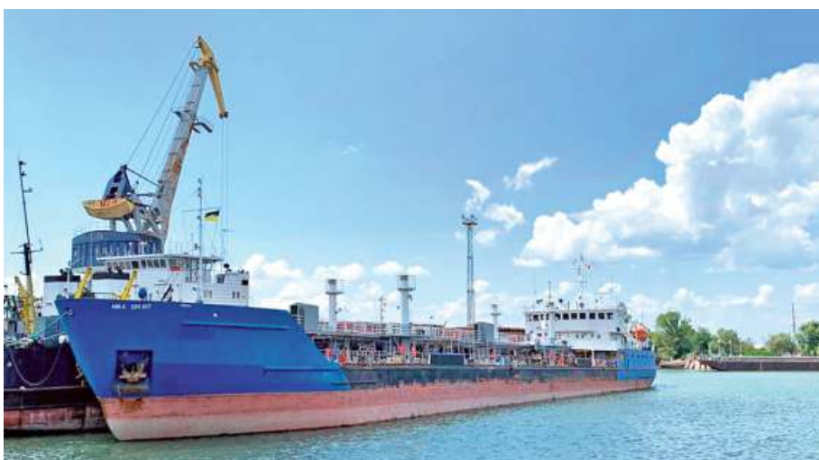
Maritime tension: The Russian tanker, called 'Nika Spirit', detained by the Ukrainian security service in the Black Sea port of IZMAIL on Thursday.

The crew members were later freed by Ukraine and were on their way home, but the tanker remained in Ukrainian custody in the Danube river port of IZMAIL, a spokesman for the Russian Embassy in Kiev said by telephone.