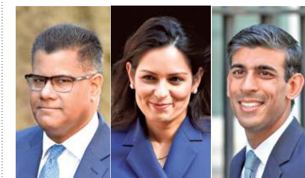
(From left) Alok Sharma, Priti Patel and Rishi Sunak.