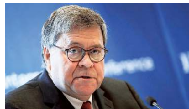
U.S. Attorney General William Barr.

U.S. President Donald Trump has called for increasing use of the death pe-