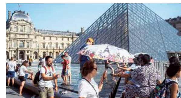
Beating the heat: People cool off next to the fountains at Louvre Museum in Paris on Wednesday.

On Thursday afternoon the Paris area hit 42.4 degrees Celsius, beating the previous record of 40.4 C set in 1947. Authorities said the temperature was still rising, as a result of hot, dry air coming from northern Africa that's trapped between cold stormy systems.