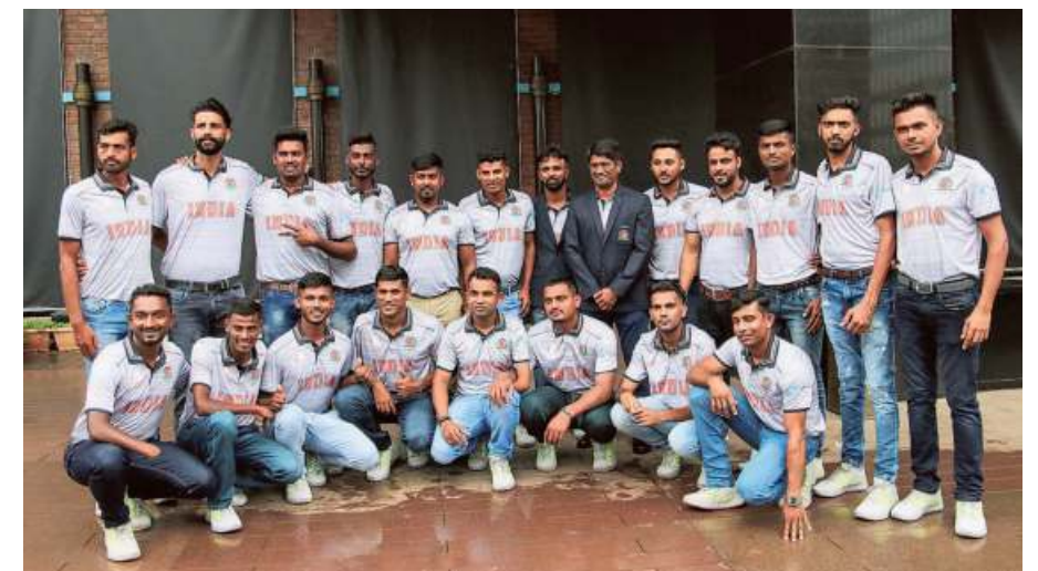
On a mission: Indian Divyang Cricket team poses for lensmen ahead of its departure to England where it will play the 6-Nation Physical Disability World Cricket Series in August.