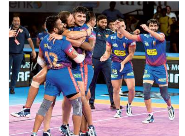
Moment to savour: Dabang Delhi players celebrate an incredible win over Tamil Thalaivas.