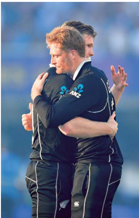
Tough luck: James Neesham shared pictures with his teammates in an Instagram post, including the one where he can be seen consoling Martin Gupthill.

"It's hard to really dissect an experience like that until you get a bit of distance. Sure some things didn't fall our way, but we went into the cup saying we were gonna fire some shots and scrap like hell and boy did we do both of those. Another day things might have been different but I wouldn't trade this group of men for the world," Neesham said.