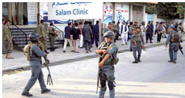
On alert: Afghan security personnel securing the site of the attack in Kabul on Sunday.