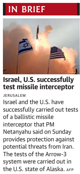
IN BRIEF Israel, U.S. successfully test missile interceptor

JERUSALEM Israel and the U.S. have successfully carried out tests of a ballistic missile interceptor that PM Netanyahu said on Sunday provides protection against potential threats from Iran. The tests of the Arrow-3 system were carried out in the U.S. state of Alaska. AFP