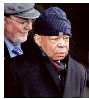
Democrat Congressman Elijah Cummings

Mr. Trump's comments triggered a torrent of criticism and he defended them on Sunday in another burst of tweets.