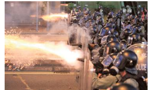
In the crosshairs: Policemen firing tear gas shells at protesters in Sai Wan, Hong Kong, on Sunday.

Mr. Navalny on Sunday was taken to hospital from jail after suffering what his press secretary said was a "severe allergic reaction", despite having never suffered from allergies.