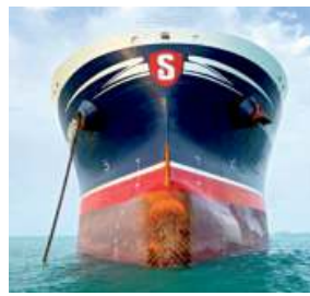
The British-flagged vessel Stena Impero is seen at the Bandar Abbas port.

Britain said last Monday it was planning a European-led force to escort tankers through the world's busiest oil shipping lane, the Strait of Hormuz, in response to Iran's seizure of the U.K.-