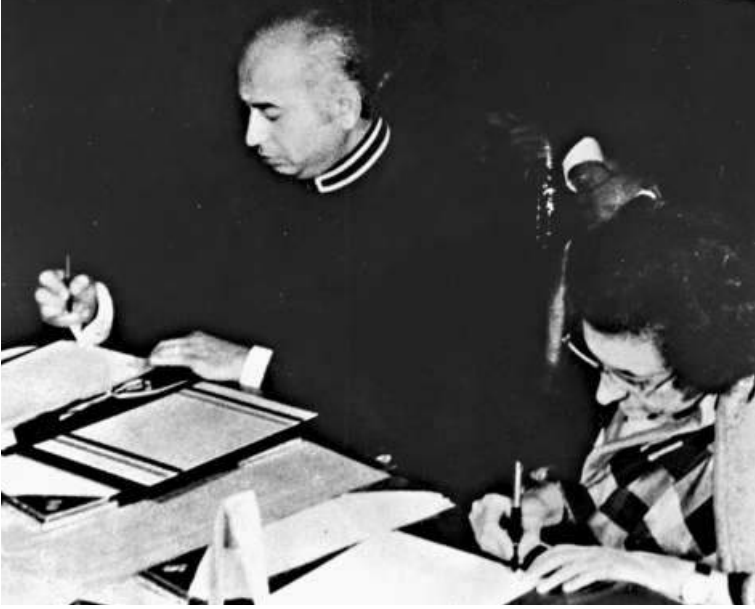
Prime Minister Indira Gandhi and Pakistan President Zulfikar Ali Bhutto signing the Simla Agreement in July 1972.

tever we have to do,” he said. “But I think it’s something that can be brought back together.”