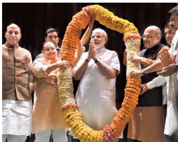
Well done! PM Narendra Modi being felicitated at the BJP parliamentary party meeting on Tuesday.

According to sources, Mr. Modi said, "Whoever it may be, whoever's son he may be... such arrogance, misbe-