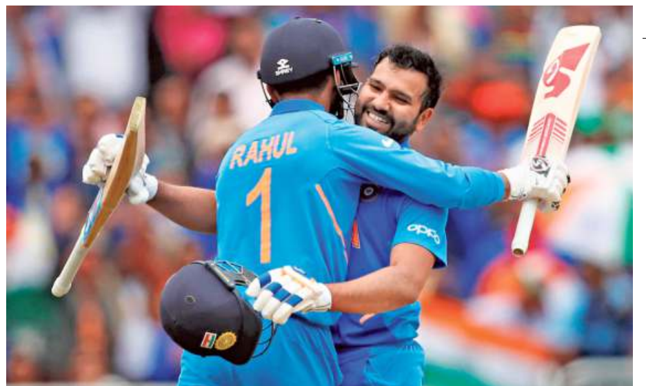
Hitman at it again: Rohit Sharma celebrates his century with K.L. Rahul.

The opener and his partner K.L. Rahul (77) added 180 for the first wicket and that,