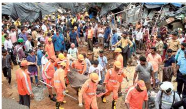
Caved in: Rescue workers recovering the bodies at the site of a wall collapse at Pimpripada.

The 375.2 mm deluge in 24 hours till 8 a.m. on Tuesday threw flight operations out of gear. Local train services were badly hit. After the India Meteorological Department (IMD) forecast heavy rain for July 2, the author-