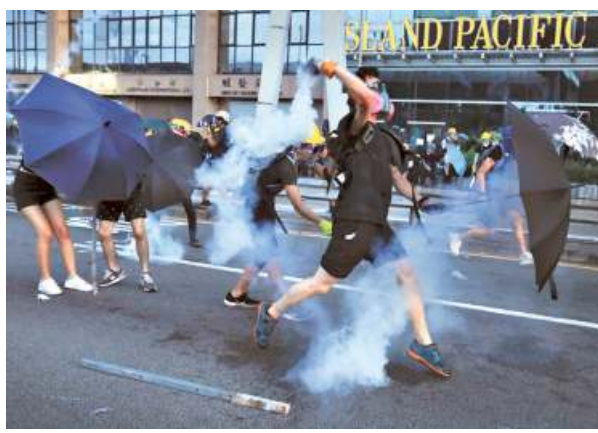
Chaos on streets: A protester throwing a tear gas canister back at the police in Hong Kong on Sunday.

The official also made it explicit that there were no differences between central and local atrocities in Hong Kong which protesters and their backers could exploit. "The central government firmly supports Chief Executive Carrie Lam leading the