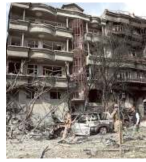
Security forces inspecting the site of attack in Kabul on Monday.

"The government has not paid attention to the candidates' security," said Qadir