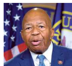
Elijah Cummings.

"I understand that everything that Donald Trump says is offensive to some people," Mr. Mulvaney said. But he added, "The President is