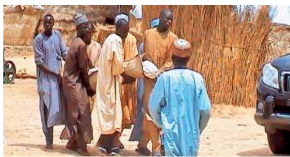
Men carry a body for burial in Budu near Maiduguri.