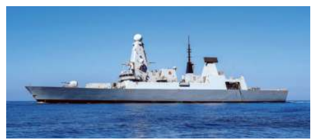
Safe transit: The British destroyer, HMS Duncan, will support the safe passage of ships through the Strait of Hormuz.

The Royal Navy destroyer joins frigate HMS Montrose, which is due to undergo maintenance in nearby Bahrain in late August. It will be replaced by another frigate,