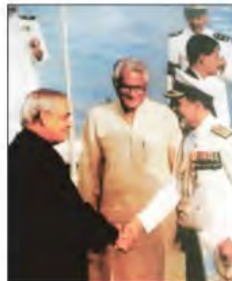
Atal Bihari Vajpayee, George Fernandes, Sushil Kumar.

Making a presentation on Enduring Freedom, the delega-