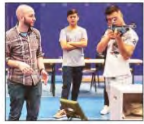
Italian shooter Niccolo Campriani at a selection process earlier this year

Olympic Games, missed podium finish by a heartbreakingly narrow margin. Campriani's farewell shot, in equally dramatic circumstances, fetched him an Olympic gold, the third of his stellar career.