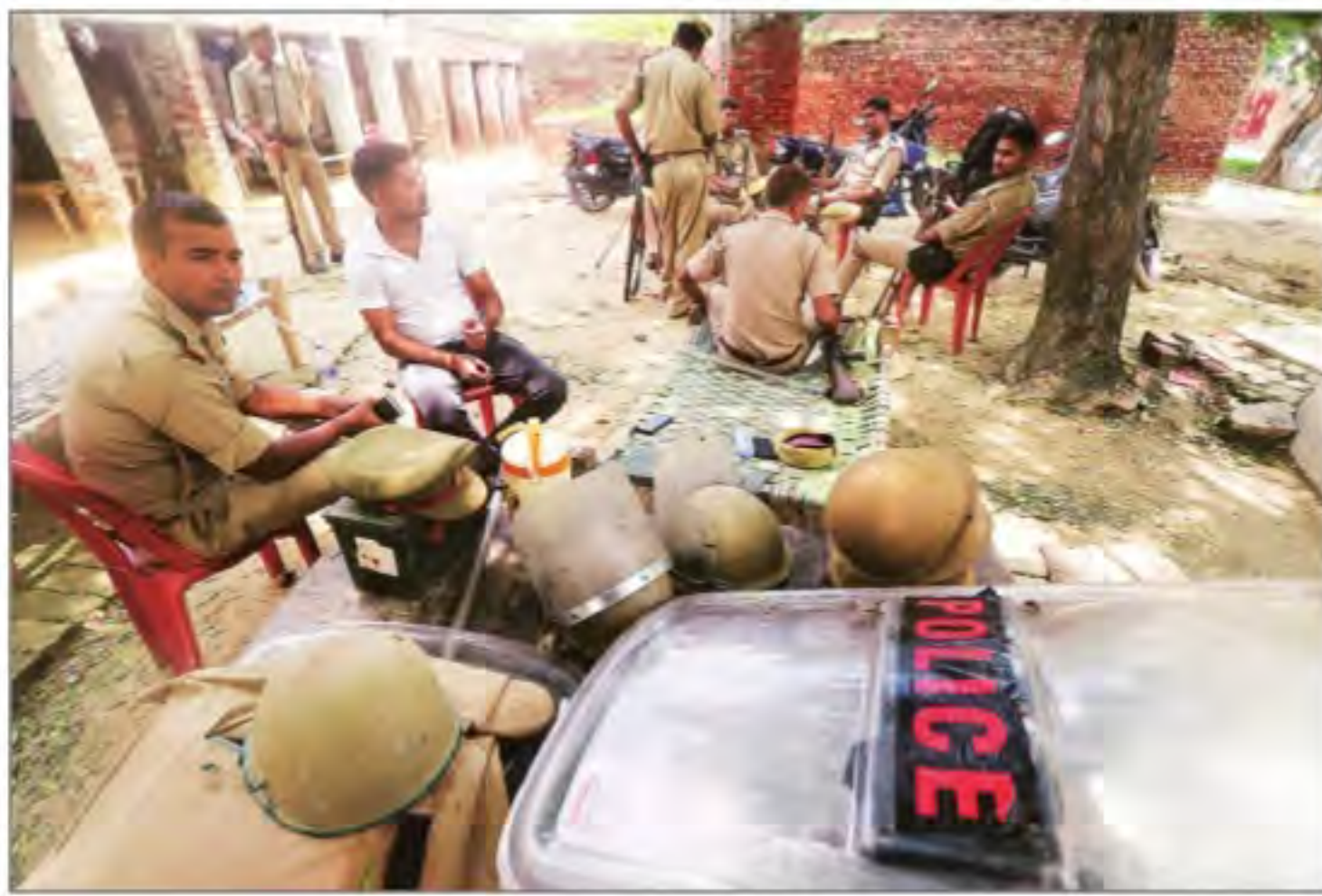
Police personnel deployed at the village of the Unnao rape victim on Monday.