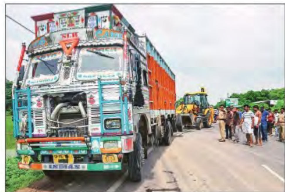
The truck which collided with the car in which the woman, her relatives and lawyer were travelling.

Uncle claims her security detail leaked her whereabouts, police say checking