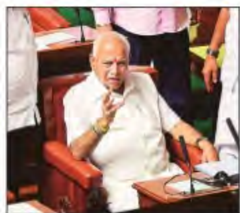
B S Yediyurappa during the trust vote on Monday.

Yediyurappa sails through trust vote, Speaker puts in his papers