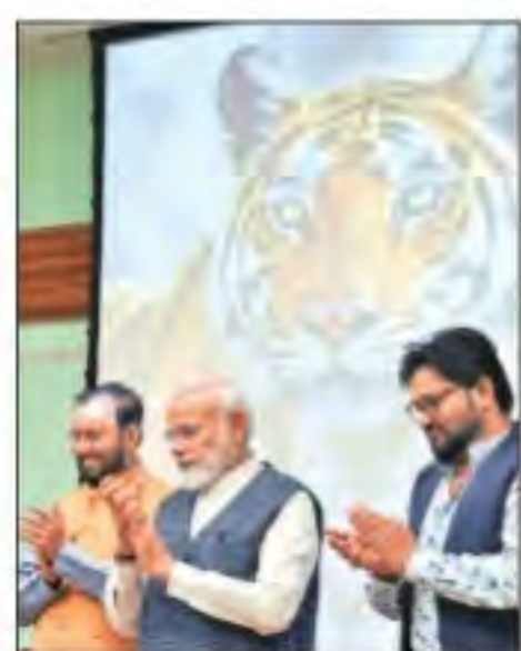
At the release of the report in New Delhi, Monday.