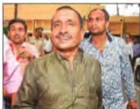
BJP MLA Kuldeep Singh Sengar.

The woman was injured Sunday afternoon when the car in which she, her lawyer and two aunts were travelling collided with a truck, which had one number plate blacked out, in Gurubakshganj. The truck owner and the driver have been detained on charges of conspiracy. The woman's uncle has