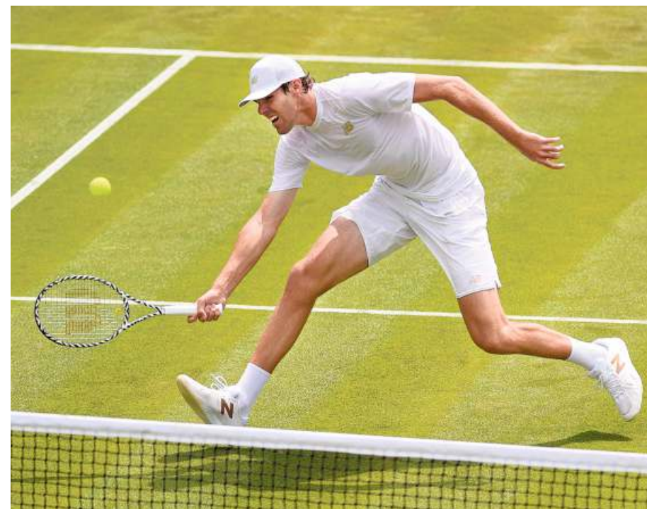
Big scalp: Reilly Opelka, the tallest player on the men's circuit who is debuting at The Championships, outlasted Stan Wawrinka over five sets.

Opelka will be appearing in the third round at a Slam for the first time having never won a grass court match in his career prior to coming to Wimbledon.