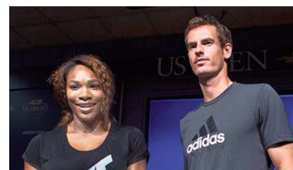
Serena Williams and Andy Murray.

The new roof on Wimbledon's Court One was used for the first time on Tuesday - but for fading light rather than for rain. A decision was made to shut the roof at 5-5 in the final set