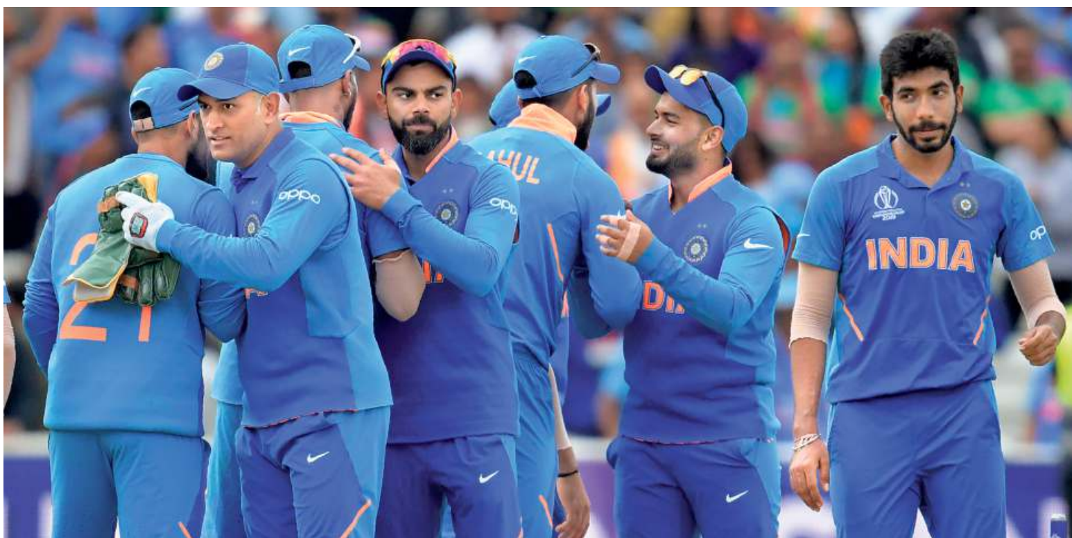
Well done, mate! After overcoming a fighting Bangladesh, the Indians took the privilege of patting themselves on the back

India has progressed, thanks to the colossal individual performances of Rohit Sharma (544 runs), Kohli (408), Mohammed Shami (14 wickets) and Jasprit Bumrah (14). Equally, the seemingly smaller contributions have played a part, be it the ones