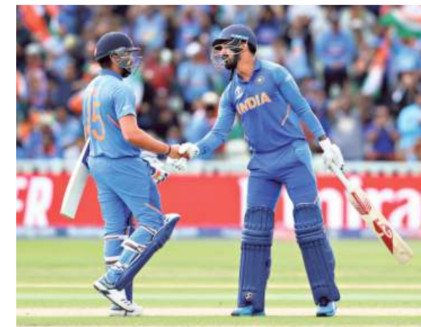
Praising the partner: K.L. Rahul says Rohit Sharma is in good form, but to keep putting up those performances is special.

Dhawan's thumb injury paved the way for Rahul's elevation to the top and subsequently he etched scores of 57, 30, 48, 0, 77 against Pakistan, Afghanistan, the West Indies, England and Bangladesh respectively in the current World Cup. The cricketer interacted with the media in the ICC's mixed zone at Edgbaston here on Tuesday