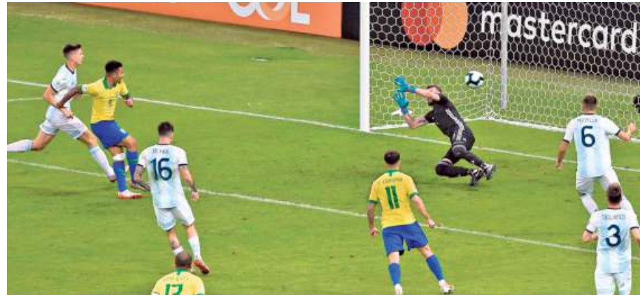
Tap-in: A flowing move started by Dani Alves ended with Gabriel Jesus, second left, making the simplest of shots to give Brazil the lead.

Brazil which lost twice in 42 games under coach Tite, will face either Peru or Chile in Sunday's final at the Maracana stadium in Rio de Janeiro and captain Dani Alves said its goal was within reach. "There is one more step to go before we fulfil our objective," he added.