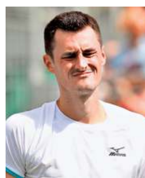
Bernard Tomic.