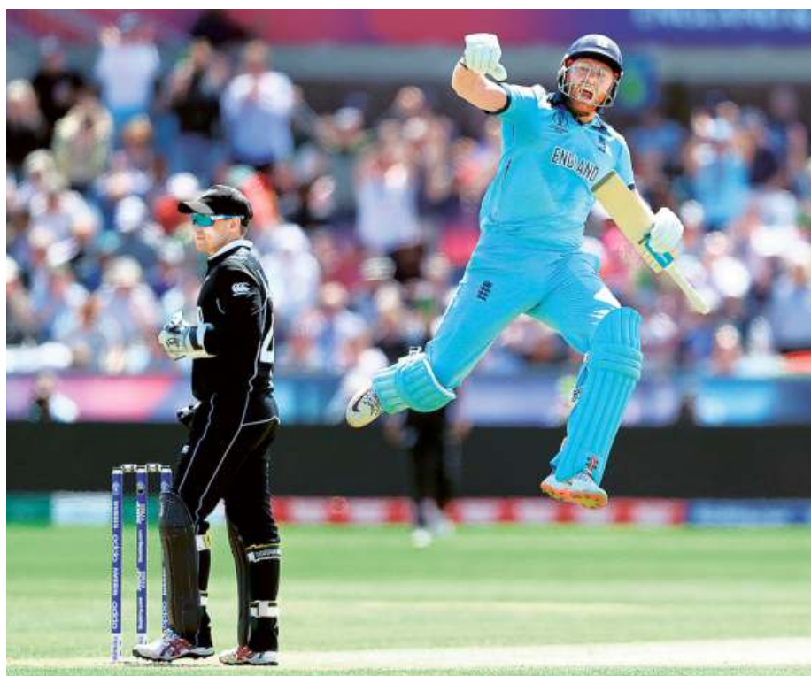
Blistering start: Jonny Bairstow's whirlwind of a knock ensured England put up a winning total

Mark Wood got a slight touch on Ross Taylor's drive in his follow-through, and