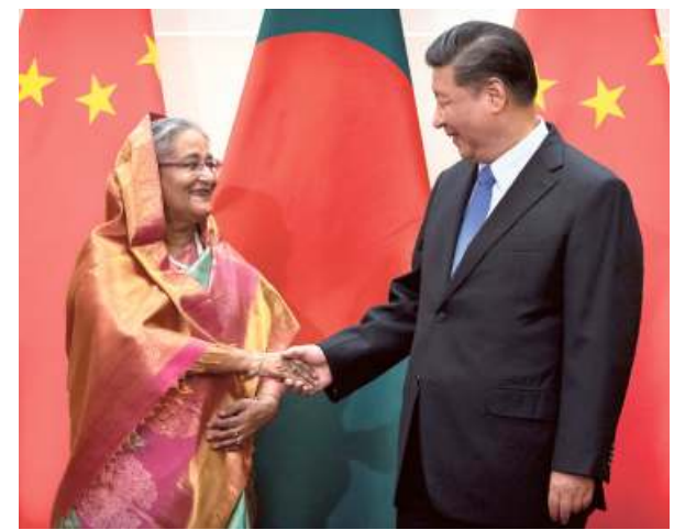
Joint approach: Bangladesh Prime Minister Sheikh Hasina with Chinese President Xi Jinping in Beijing.

After the Wuhan summit last year, China has been advocating "China-India Plus" cooperation, aimed at