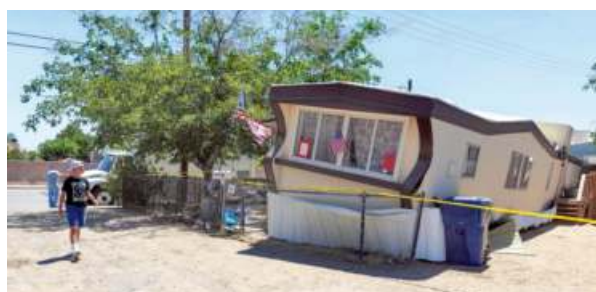
Shaken and rattled: One of the mobile homes affected by Friday's earthquake in Ridgecrest, California.

It was followed by at least 16 aftershocks of magnitude four or above, the USGS said, which also warned of a 50% or better chance of another magnitude 6 quake in the days ahead. "We've got fires, we've got gas leaks, we've got injuries, we've got