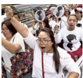
A protest in Yangon on Saturday demanding justice for the girl.

Wednesday and charged with the attack, although there is public scepticism over whether the authorities have the right person.