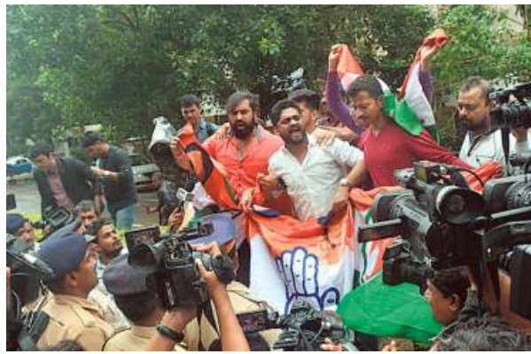
Youth Congress workers protesting in Mumbai on Sunday, demanding that the MLAs take back their resignations.

returned to Bengaluru from the U.S. on Sunday night, immediately met senior Congress leaders, including AICC general secretary K.C. Venugopal, Mallikarjuna Kharge and Siddaramaiah, and JD(S) leaders. He was expected to address the JD(S) Legislature Party meeting, which hadn't started till the time of going to the press.