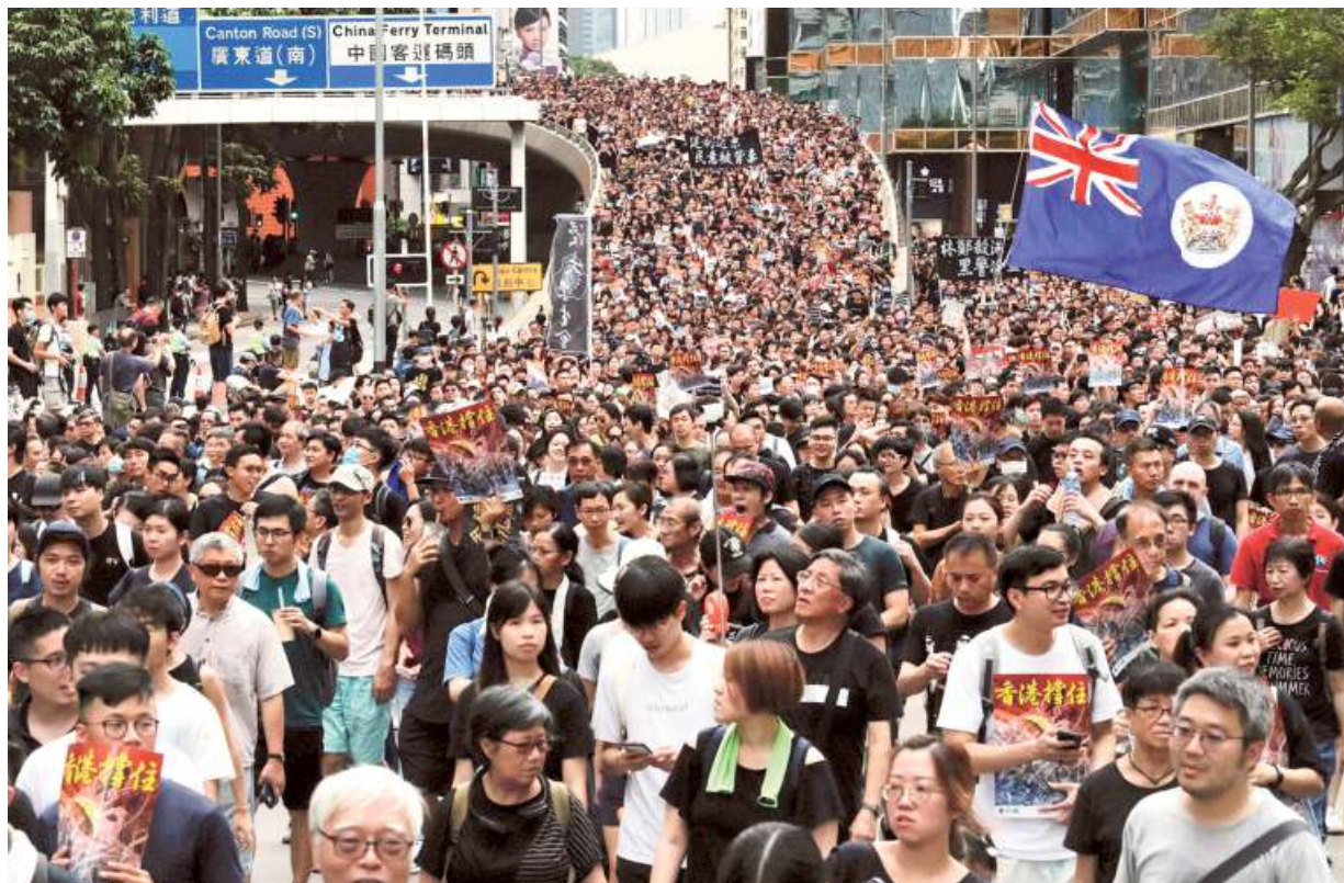
Protesters in Hong Kong on Sunday rally outside a controversial train station linking the territory to the Chinese mainland, the latest mass show of anger as activists try to keep pressure on the city's pro-Beijing leaders. (REPORT ON PAGE 14)