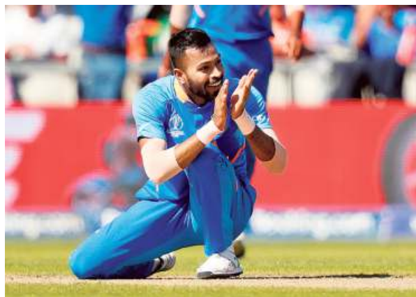
Making his presence felt: Hardik Pandya has played some good knocks in the middle-order.

Rohit the class act: The secret behind his great progress in ODIs is that he understands his game and has a template which he follows and it has given him success. On a tour, based on the conditions and the country we are playing, we interact as to what tweaks could be added. But all credit to him because he has worked hard and for any batsman to get five hundreds (in the World Cup) is very special. It is not just about his personal success; he is also helping K.L.