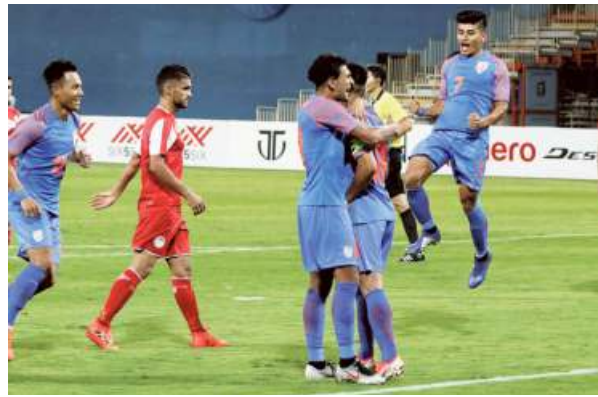
Shortlived: India went ahead in the fourth minute and also added a goal in the 41st, but Tajikistan rallied well.

India's dominance was complete in the opening half, the new-look side getting into quick passing bouts that head coach Stimac has been trying to inculcate. The Croatian left out seasoned defender E. Anas and Sandesh Jinghan after both suf-