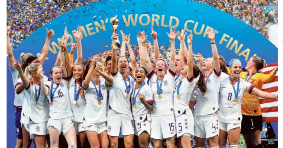
Top of the world: The U.S. women's team celebrates its triumph.

"It's surreal. I don't know how to feel like now. It's ridiculous," Rapinoe said. "We're crazy and that's what makes us so special. We just have no quit in us. We're so