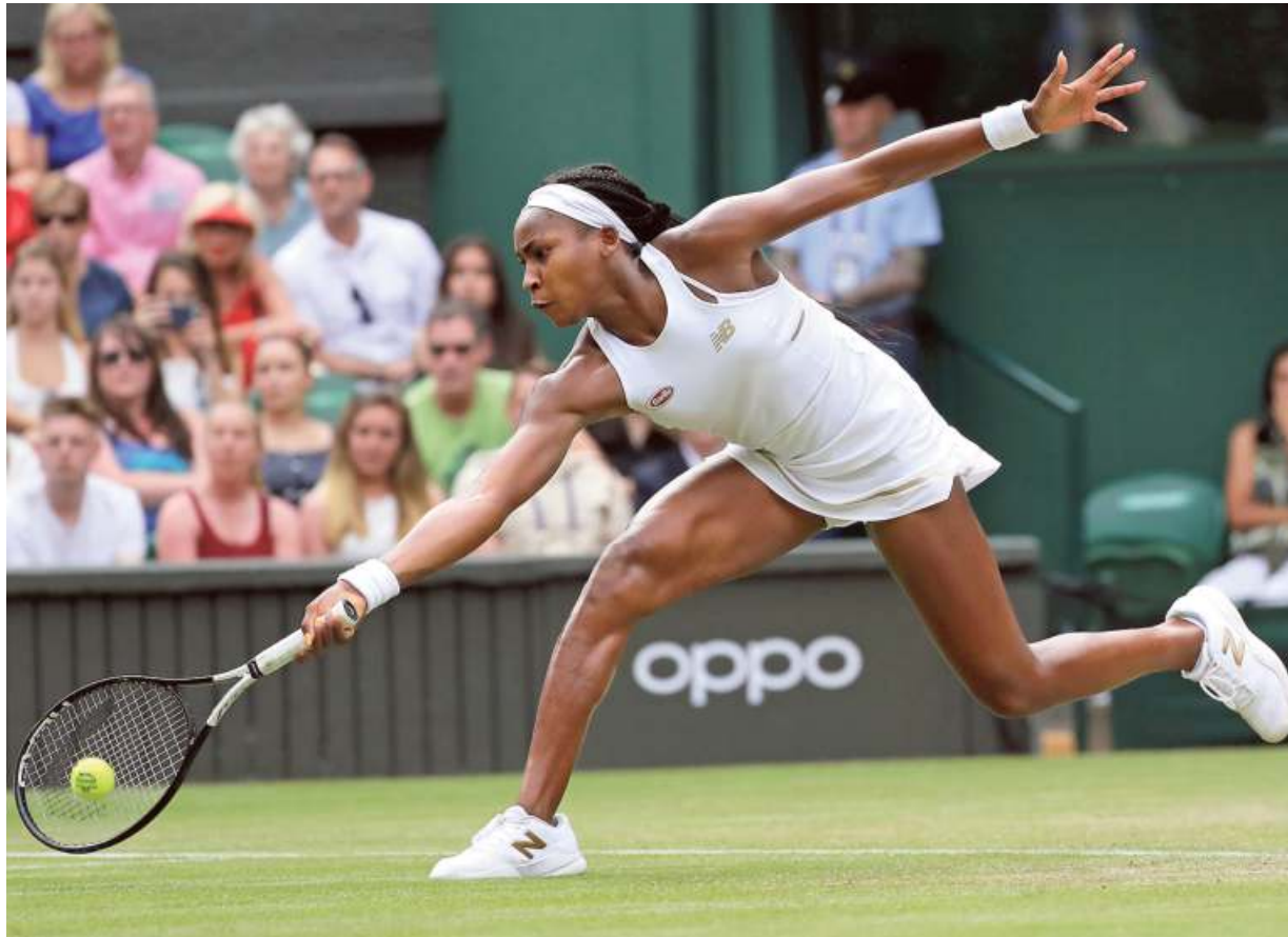
Signs of a break-out star: Cori Gauff has captured the imagination of millions world-wide, and her biggest achievement thus far has been her steadfast refusal to fall off the emotional cliff.

There is Roger Federer, who is into the second week of Wimbledon for an astonishing 17th time in 21 years, and will hope to become the ol-