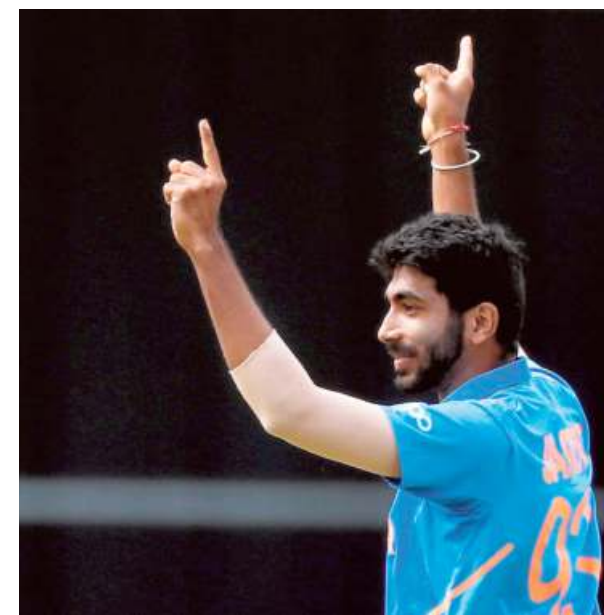
Cool customer: Jasprit Bumrah has bowled exceptionally well at the death.

Bhuvneshwar's off-day: Some days some bowlers can go for runs. We bowl a lot of difficult overs for the