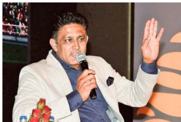
Anilspeak: Kumble feels India should choose five attacking bowlers for the semifinal against New Zealand.

Virat Kohli seemingly has another difficult decision to make in Manchester, in having to choose between Bhuvneshwar Kumar and Mohammed Shami. Kumble would prefer to see the latter in action. "If you have a slow