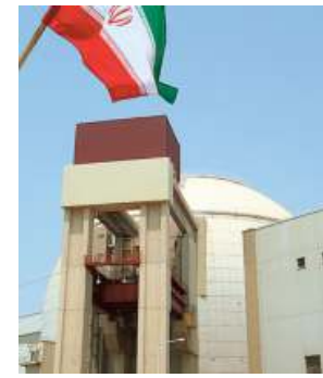
A file photo of Russian-built Bushehr nuclear power plant in southern Iran.

The two threats would reverse major achievements of the agreement, although Iran omitted important details about how far it might go to returning to the status quo before the pact, when