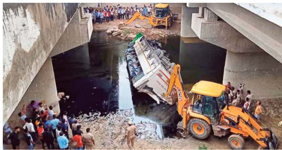
Tragic plunge: The bus which fell into a drain on the Yamuna Expressway on Monday. *SPECIAL ARRANGEMENT