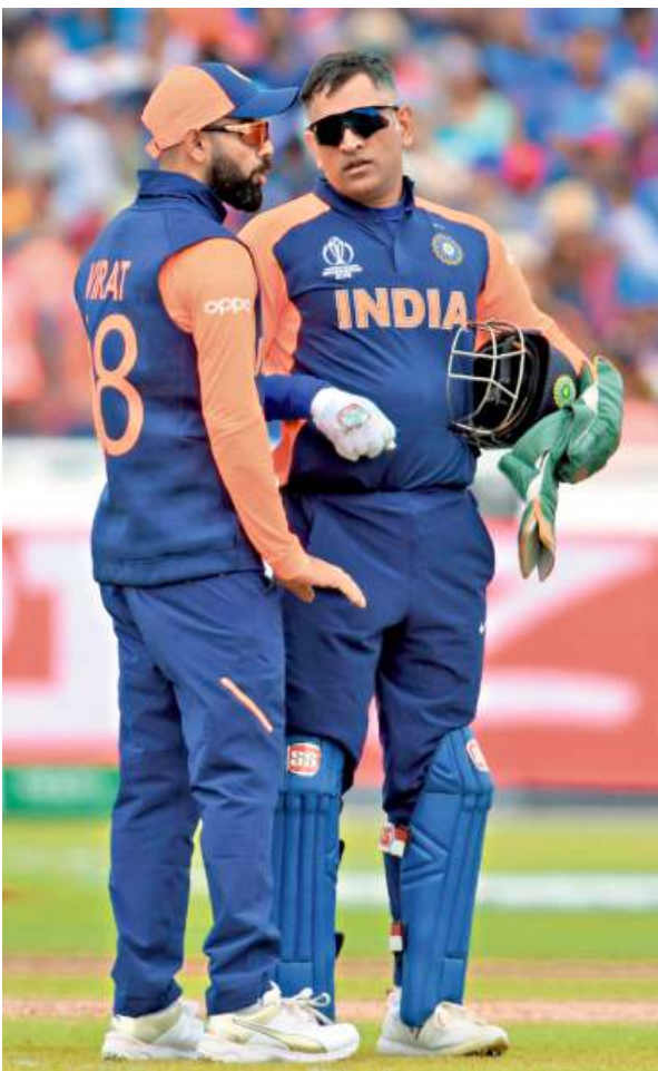
Inspirational: The passing of the baton from M.S. Dhoni to Virat Kohli has been graceful.

And then Kohli explained another critical facet – Dhoni's ability to step back and give space: "I know how difficult it can be to transition from being captain to just being a player within the