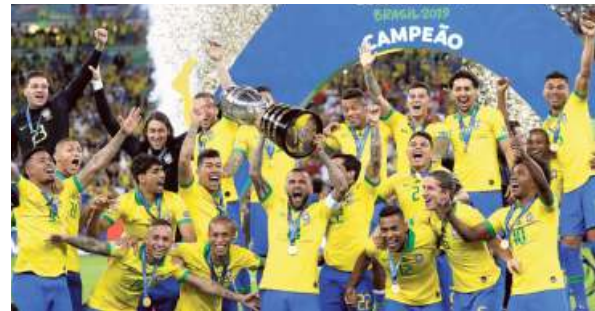
Mission accomplished: Brazil skipper Dani Alves holds the Copa America trophy on Sunday.

The result: Brazil 3 (Everton 15, Jesus 45+3, Richarlison 90pen) bt Peru 1 (Guerrero 44pen).