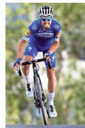
Julian Alaphilippe