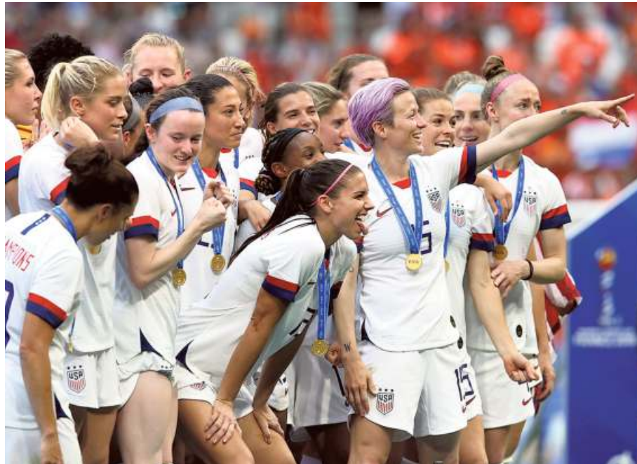
One more! USA's four World Cups stand alongside its record four Olympic golds.

"I think the level around the world is growing exponentially every year, so four years on, this was incredibly difficult because the opponent is better and the teams