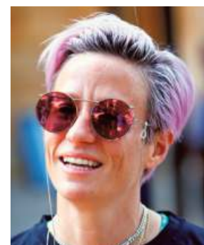
Megan Rapinoe.

Trump put that spat behind him to tweet congratulations to the team on Sunday, while Rapinoe avoided getting drawn into another discussion about whether