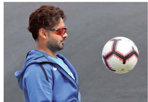
Time to deliver: Rishabh Pant needs to put his head down and play a long innings, should the need arise.