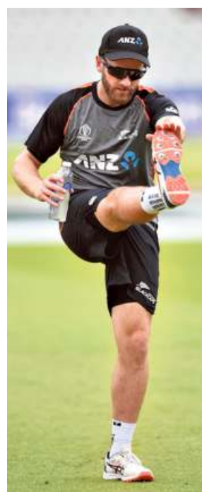
Kane Williamson.

The underdog tag: We are in the top four and we definitely deserve to be here. We had a couple of tough losses coming into this part of the tournament, but we do need to look at those for what they were. So, whether we are underdogs or not, it doesn't really matter. It is about how we turn up on Tuesday and commit to the