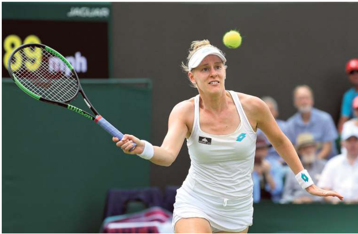
Upset of the day: Unseeded Alison Riske found the tennis to match Ashleigh Barty, beating the World No. 1 in three sets.

The highest ranked player left in the draw is No. 7 Simona Halep, who quickly brought down the high-flying 15-year-old Cori Gauff, ending her six-match winning streak 6-3, 6-3. The counter-punching Halep was the