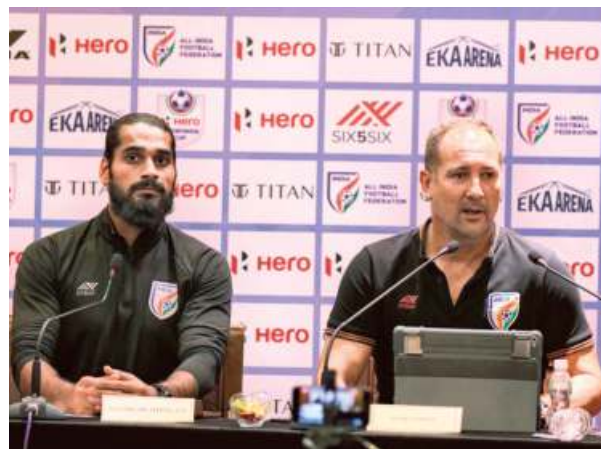
Plainspeak: Igor Stimac, right, insists that large-scale changes are needed to improve Indian football.

"We are suffering because most our Indian strikers are not playing regularly in the ISL or the I-League as they spend most of the time on the bench. Most of them do not have open place to play and that is not good for me (as