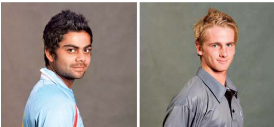
One from the album: Virat Kohli and Kane Williamson led their teams in the U-19 World Cup semifinals and are now at the helm of the senior sides.

Back then, just like it is going to happen here on Tuesday, the squads clashed in the semifinal and interestingly Kohli dismissed his counterpart for 37. India won that joust and the subsequent fi-