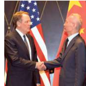
U.S. representative Robert Lighthizer with Chinese Vice Premier Liu He.

AGENCE FRANCE-PRESSE SHANGHAI U.S. and Chinese negotiators agreed to meet again in the United States in September after holding "frank" and "constructive" talks in Shanghai on Wednesday, State media said following meetings overshadowed by a Twitter tirade from President Donald Trump. U.S. Treasury Secretary Steven Mnuchin and Trade Representative Robert Lighthizer met with Vice Premier Liu He in the Chinese financial hub for the first face-to-face negotiations since a trade war truce was declared last month. "The two sides conducted frank, highly efficient and