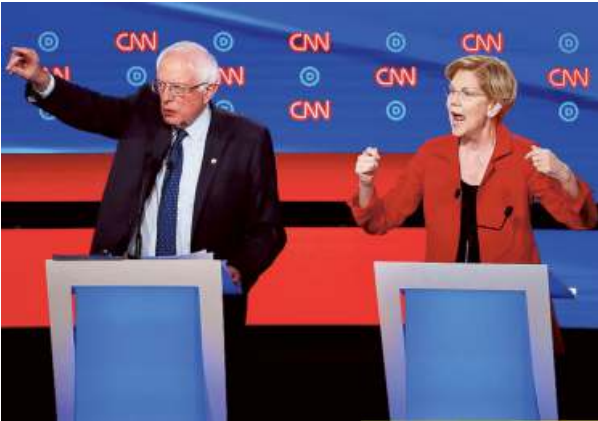
Crucial debate: Senators Bernie Sanders and Elizabeth Warren at the 2020 presidential debate in Detroit.

times by Montana Governor Steve Bullock, argued Democrats risk losing voters after moving too far to the left in the opening debate last month in Miami.