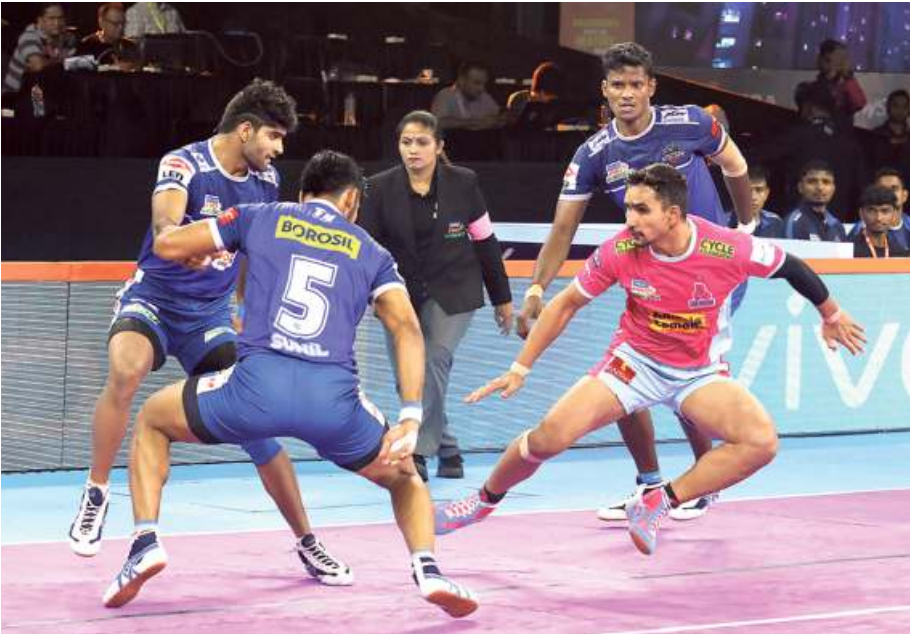
All-out aggression: Haryana Steelers' defence faced constant pressure from Jaipur Pink Panthers raiders.

Raiders opted for caution, seeing the catchers' early form. Hooda got a toe tucked down the middle for Panth-