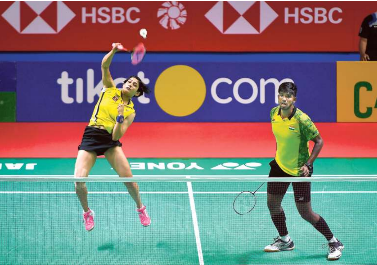
Smashing away: Ashwini Ponnappa and Satwiksairaj Rankireddy recorded one of the biggest wins of their career.

Prannoy defeated Hong Kong's Wong Wing Ki Vincent of 21-16, 22-20, while Kashyap came from a game down to beat Israel's Misha Zilberman 18-21, 21-8, 21-14.