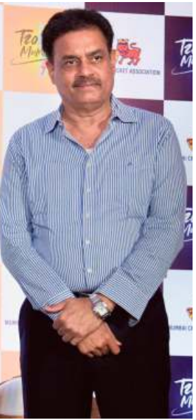
Dilip Vengsarkar.