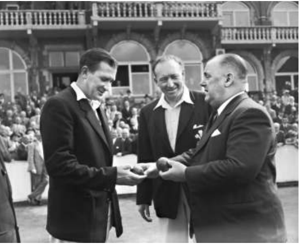
Dream spell: Jim Laker is presented with the two balls with which he took nine and 10 wickets in a Test against Australia at Old Trafford.

On July 31, 1956, he became the first bowler to take 10 wickets in an innings