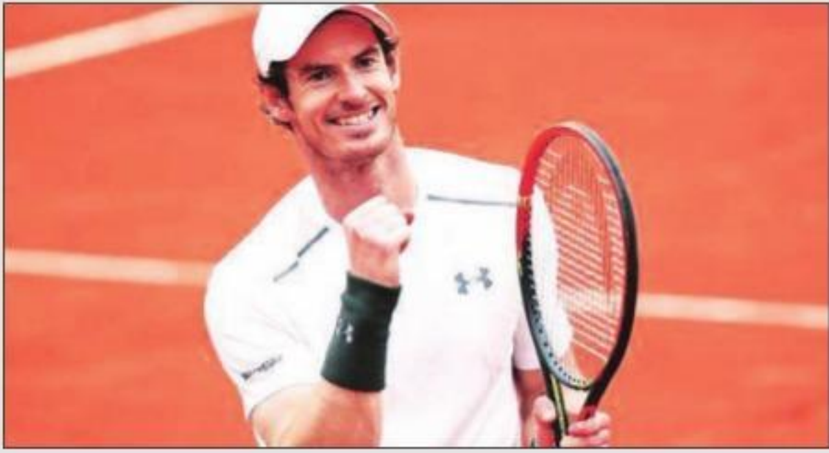
Andy Murray's first match next week in Cincinnati will be his first competitive singles outing since the Australian Open in January.