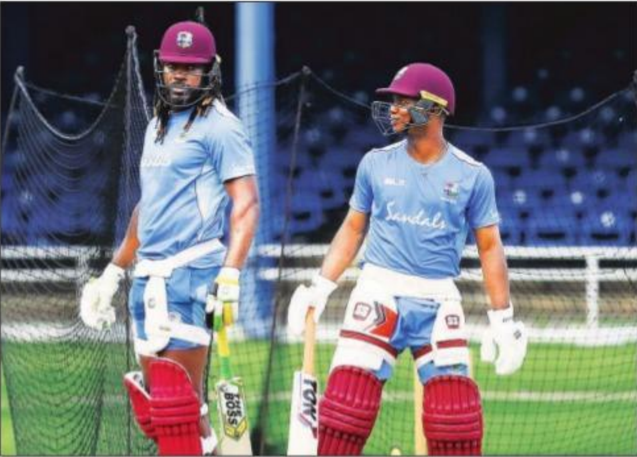
West Indies's Chris Gayle and Evin Lewis attend a practice session in Port of Spain on Saturday. With the WI selection committee not paying heed to Gayle's request for a farewell Test at his home ground, the next two ODIs could well be the last of a storied international career.

"Gayle hasn't played Test matches for five years. Bringing him back for one Test,