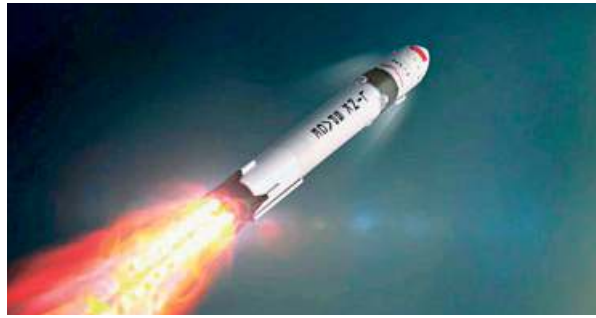
At the cutting-edge: Illustration of the prototype of a LinkSpace reusable rocket.

The RLV-T5 previously hovered 20 metres and 40 metres above the ground in