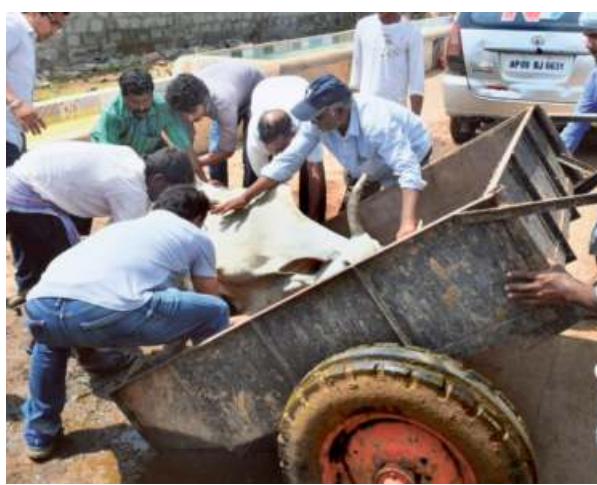
Sick cows being shifted to hospital from the Gosala near Vijayawada on Saturday.