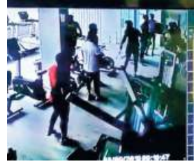
A CCTV grab of the incident inside the gym.