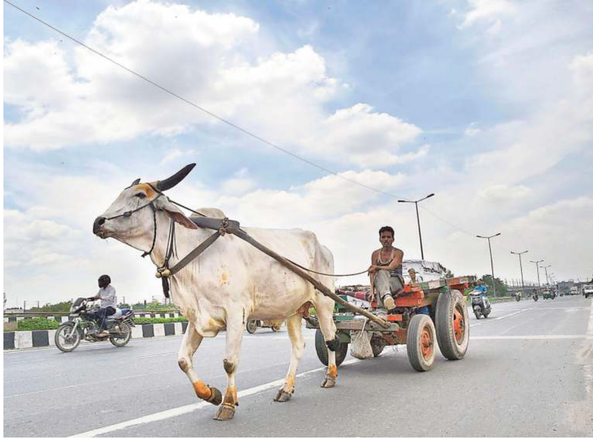
A bullock cart on Zakhira Flyover in the city. The maximum temperature in the national capital on Saturday settled at 34.3 degrees Celsius, normal for this time of the year, even as high humidity levels caused discomfort to the people. The Met Department has forecast a generally cloudy sky with light rain for Sunday. The maximum and minimum temperatures will hover around 35 degrees Celsius and 28 degrees Celsius respectively.