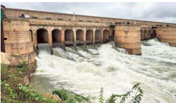
More flow: Water gushing from the Krishnaraja Sagar reservoir in Karnataka on Saturday.

4% increase overnight Idukki, Kerala's biggest reservoir, improved storage by 4% overnight, touching 34%, which is 503 million cubic metres (MCM) of water against the maximum of 1,460 MCM. Intense rain along the Western Ghats sent big flows into reservoirs