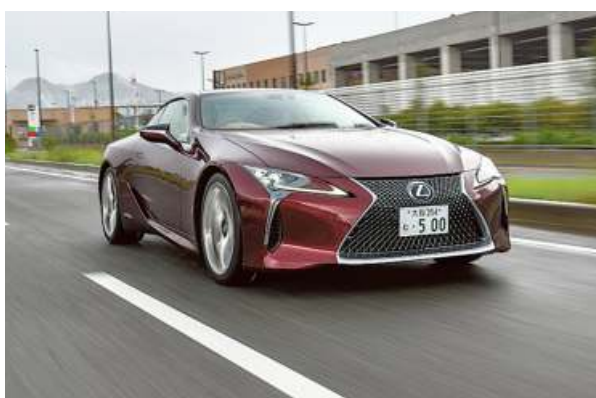
Poetry in motion: Luxury cars account for only 1.2% of the passenger car market in India.

Currently, the company is selling six models in India and is gearing up to introduce LC 500, a luxury sports