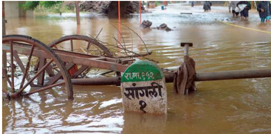
All-time high: Sangli has already received 758% rainfall over the long period average. In 2005, the area recorded only 217% over the course of 31 days. ■ JIGNESH MISTRY

Chief Minister Devendra Fadnavis said a team of 100 doctors had been despatched to the region even as thousands of stranded people were rescued from the submerged areas, including 1,016 persons from the Maharashtra-Karnataka border. Rescue work by the Goa Naval Area is under way in Kolhapur and Uttar Kannada (Karnataka) district and so far 602 women and 193 children had been rescued. In another operation by the