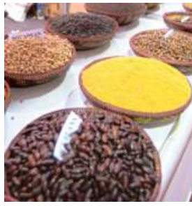
The legislation will make quality regulation uniform.

The new Bill removes the word "certain", and aims to regulate the quality of all seeds sold in the country, as