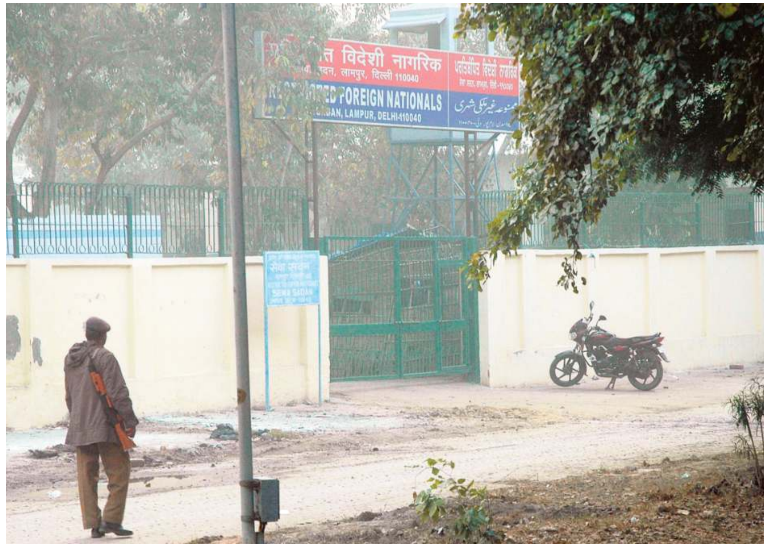
Several foreign nationals are lodged at the Lampur Detention Facility in Narela.

However, earlier this year, Commonwealth Human Rights Initiative (CHRI) published a report titled 'Strangers to Justice', in which they tallied the number of FNPs across 22 States