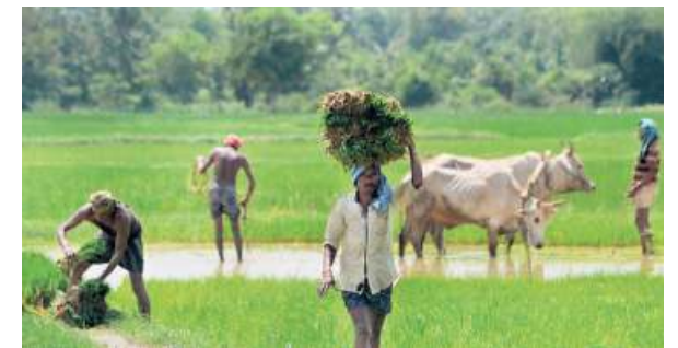
A farmer carries paddy saplings for replanting in his field on the outskirts of Bhubaneswar.

The draft policy states that comparing the CAGR with other Indian States, Odisha's growth rate emerges as the highest in the country during that period.