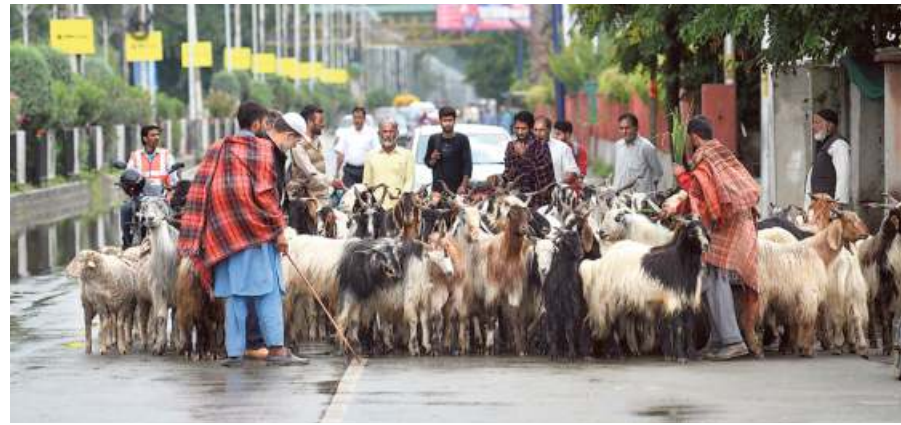
Not much cheer: With restrictions relaxed, Srinagar is returning to normality.

But for the police personnel of Jammu and Kashmir, who have been at the forefront of the lockdown in the Valley, there was little respite as they continued to face angry and cold stares from residents.