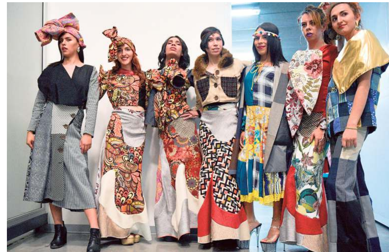
Turning heads: Transgender models pose backstage before a fashion show organized by the GPSGAY social network for the LGBT community in Bogota, Colombia.