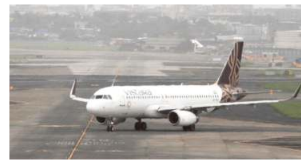
Doubling up: The airline will expand its fleet twofold to reach 41 aircraft by the end of this calendar year. ■ PRASHANT WAYDANDE

The airline will first connect destinations where it al-