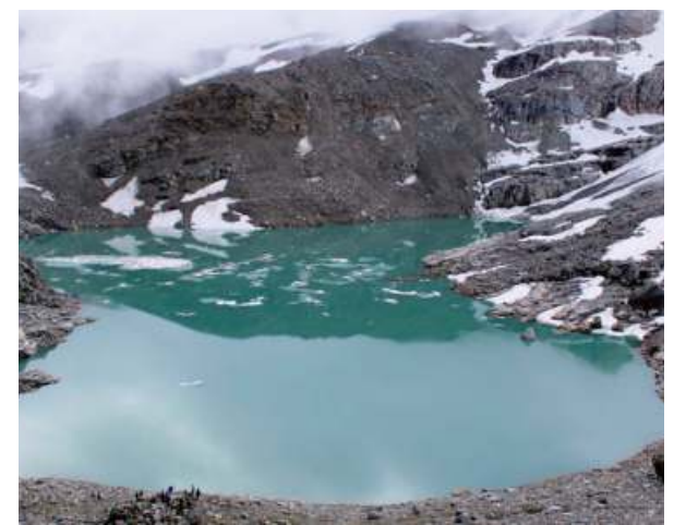
A view of Kajin Sara lake. •SPECIAL ARRANGEMENT

"As per the measurement of the lake by the team, it is located at an altitude of 5,200 metres, which is yet to be officially verified. It's estimated to be 1,500 metres long and 600 metres wide," said Mr. Ghale. He said if the official inspection confirms