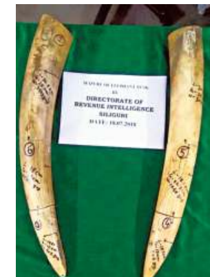
A pair of elephant tusks seized in West Bengal in July 2018.

"We concluded that samples collected from India