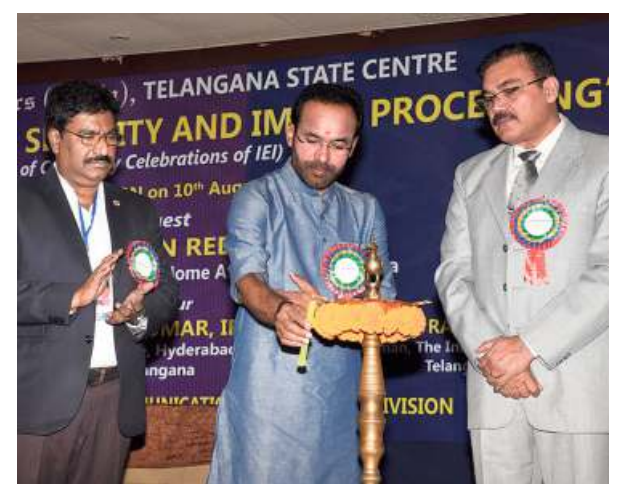
Minister G. Kishan Reddy inaugurating the seminar on cyber security in Hyderabad on Saturday.

The Minister said the people of Jammu and Kashmir