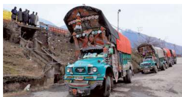
Red signal: A file photo of trucks from Pakistan moving towards the trade facilitation centre near Uri.

Trade relations had already been strained by the Pulwama terror attack, with India having imposed a 200%