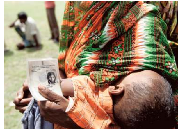
Saving lives: Counselling and practical support to women are key to promoting breastfeeding.

Mother's milk is one of the most cost-effective interventions to save children, says official