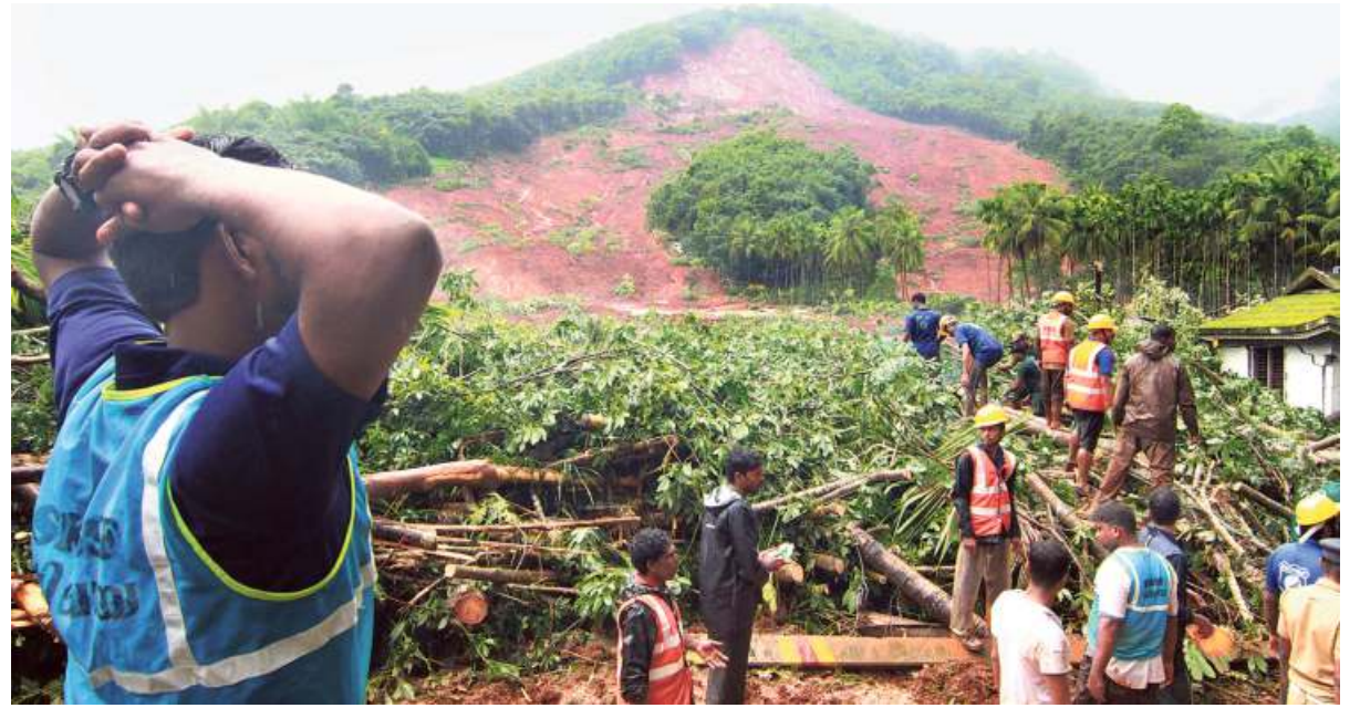
Nature's fury: Only nine bodies of the 40 people who were caught in the landslide in Kavalappara, Malappuram, have been recovered. The rescue mission has been suspended midway following two fresh landslips. ■SAKEER HUSSAIN

Chief Minister Pinarayi Vijayan, addressing the media after a review of the situation, said 80 landslips have struck eight flood-hit districts over the past two days. "Landslips are occurring in the most unexpected places. Rescue operations are in progress in all the affected districts," he said.