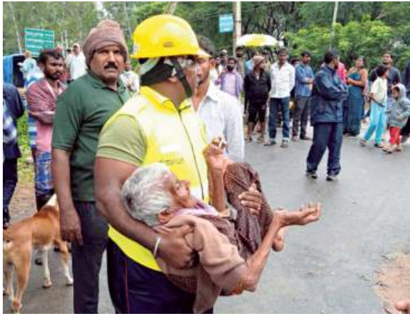
A team of volunteers shifting people from a flood affected area in Shivamogga on Saturday.

ANANTAPUR The Anantapur police in the past one month have been able to destroy 4,263 illicit liquor brewing points. By working in close coordination with local people and other Andhra Pradesh government departments, they have been effectively curbing the running of belt shops (illicit liquor shops). Superintendent of Police B. Satya Yesu Babu said on Saturday that police personnel needed to check the flow of illicit liquor in a more effective way by closing all illicit outlets in villages.