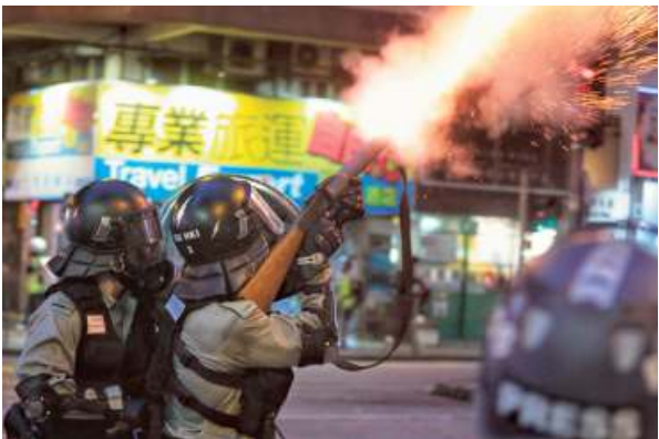
Police crackdown: Teargas shells being fired towards protesters in Wan Chai district of Hong Kong on Sunday.

Police also denied the protesters a permit for a second rally in the city's working class Sham Shui Po neighbourhood.