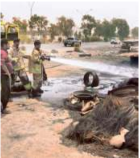
Firefighters extinguishing a blaze following clashes in Mansoura, Aden on Sunday.

Since the fighting flared on Thursday, around 40 people have been killed and 260 others including civilians wounded, according to the UN.