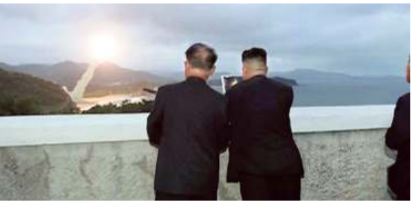
In this television grab, North Korean leader Kim Jong Un (right) watching the test-firing of a weapon system.

Korean Central News Agency followed Mr. Trump's comments that Mr. Kim had expressed a willingness to