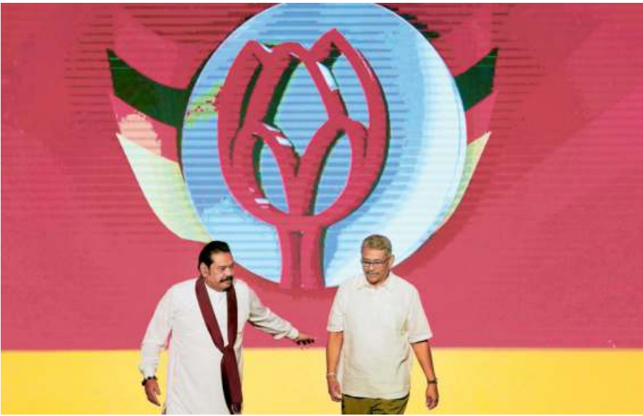
Brothers in arms: Sri Lanka's former defence secretary Gotabaya Rajapaksa (R) with his brother and former president Mahinda Rajapaksa in Colombo on Sunday.

Making the announcement at Sugathadasa stadium that was packed with Rajapaksa supporters, the former President said: "I am not the one choosing him. You have already chosen