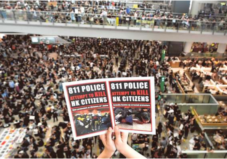
Sea of black: Demonstrators gather inside the Hong Kong international airport to protest against the police action on Monday.

More protests People in the Asian financial hub responded by taking to the streets again, picketing a police station and returning in their hundreds to a metro station where police had hit activists with batons, to protest against the heavy-handed tactics. The increasingly violent demonstrations have