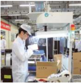
A staff working on a phone production line of a factory in Dongguan, China.

The U.S. is delaying tariffs on Chinese-made cellphones, laptop computers and other items and removing other Chinese imports from its target list altogether in a move that triggered a rally on Wall Street. The Office of the U.S. Trade Representative said on Tuesday that it is still planning to go ahead with 10% tariffs on about $300 billion in Chinese imports, extending the import taxes on just about everything China ships to the U.S. in a dispute over Beijing's aggressive trade policies. Most of the levies are scheduled to kick in September 1. But the agency says it would delay the tariffs to December 15 on some goods, including cellphones, laptop computers, video game con-