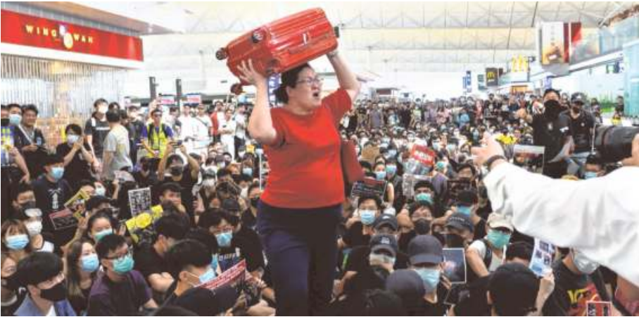
Terminal woes: A woman shouting at the crowd as she tries to enter the departure area of the Hong Kong international airport, access to which was blocked by protesters.

Flights leaving Hong Kong were disrupted for a second day on Tuesday, plunging the former British colony deeper into turmoil as its stockmarket fell to a seven-month low, and its leader said it had been pushed into a state of "panic and chaos". Ten weeks of increasingly violent protests have roiled the Asian financial hub as thousands chafe at a perceived erosion of freedoms and autonomy under Chinese rule. The protests, which China this week likened to terrorism, present President Xi Jinping with one of his biggest challenges since he came to power in 2012. Check-in operations were suspended at 4.30 p.m. on Tuesday, a day after an unprecedented airport shutdown, as thousands of black-clad protesters jammed the terminal, chanting, singing and waving banners. "Take a minute to look at our city, our home," Chief Executive Carrie Lam said, her voice cracking, at a news conference in the government headquarters complex, which is fortified behind 6-foot-high water-filled barricades. "Can we bear to push it into the abyss and see it smashed to pieces?" The protests began as opposition to a now-suspended Bill that would have allowed suspects' extradition to mainland China, but have swelled into wider calls for democracy. "Sorry for the inconvenience, we are fighting for the future of our home," read one protest banner at the airport.