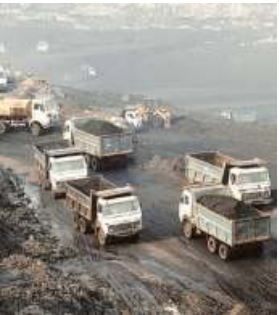
Black gold: Trucks on the move in the Mahanadi coal fields in Odisha.

This relaxation was necessary because of a change in