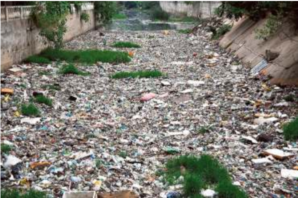
Obstacle course: Plastic garbage dumped in a canal at Chepauk in Chennai.

For the last five years, ever since the SBA was launched on Gandhi Jayanti in 2014, its main focus has been on eliminating open defecation by constructing toilets and promoting their usage through widespread behaviour change programmes. With the October 2, 2019 deadline looming near, and the original goal almost achieved according to