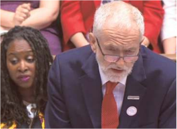
A file photo of Labour Party leader Jeremy Corbyn speaking during a session in the House of Commons in London.

"Millions of jobs are being lost in China to other non-Tariffed countries. Thousands of companies are leaving. Of course China wants to make a deal. Let them work humanely with Hong Kong first!" Trump wrote on Twitter, in the first clear indication that the trade deal could be threatened by how Beijing reacts to the protests. "I have ZERO doubt that if President Xi wants to quickly and humanely solve the Hong Kong problem, he can do it," Mr. Trump said in a subsequent tweet, suggesting a "personal meeting" with Chinese counterpart Xi Jinping. Activists are planning another series of rallies this weekend.