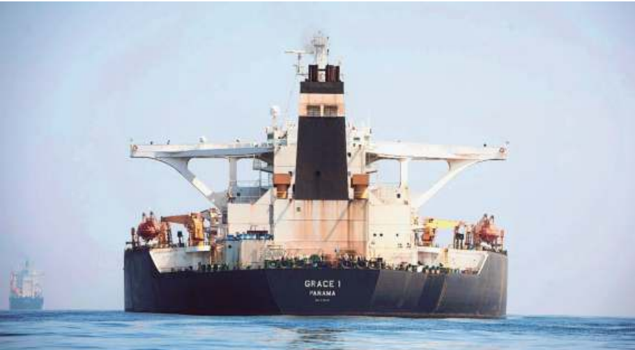
Easing tension: Grace 1 tanker in the British territory of Gibraltar on Thursday.