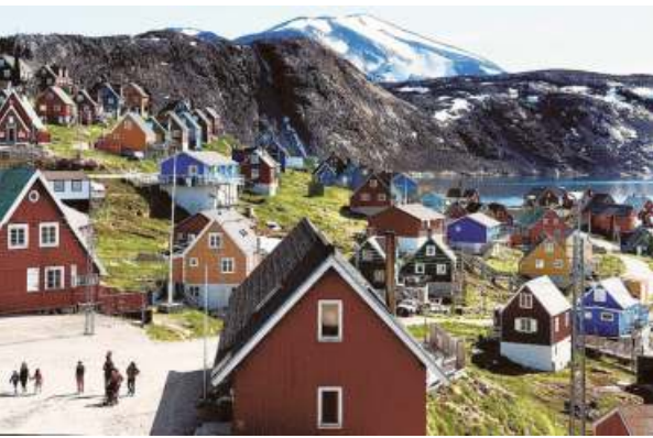
Danish politicians on Friday poured scorn on the idea.

of July led to nowhere. Mr. Trump's National Security Adviser, John Bolton, has been a longtime advocate of arms sales to Taiwan. Some analysts say China could retaliate by punishing U.S. companies with sanctions, which it has done in the past. The sale of 66 jets to Taiwan would be the largest single arms package transaction between the U.S. and the democratic, self-governing island in years. NY TIMES