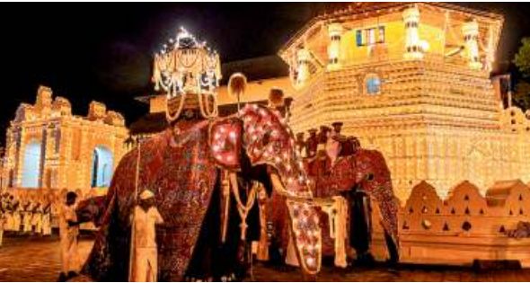
Tedious walk: Elephants at the Esala pageant in Kandy.