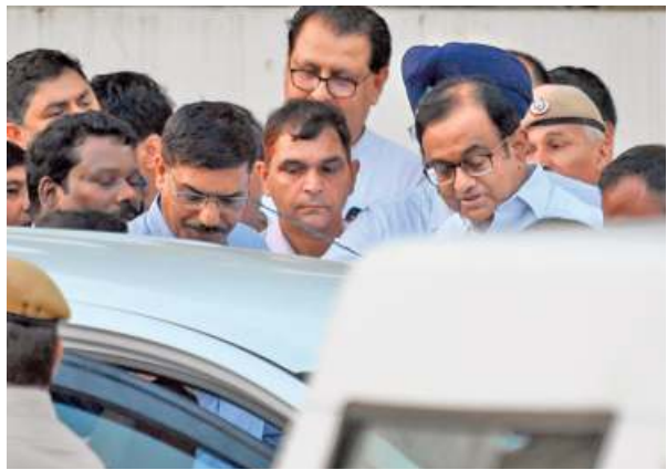
No relief: P. Chidambaram leaving the CBI court in New Delhi on Thursday.

"Considering all the facts and circumstances of the case as brought to the notice of the court, I am of the view that police custody remand