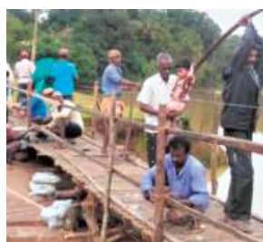
Brahmanakeppige residents carry out the work in Shivamogga district.