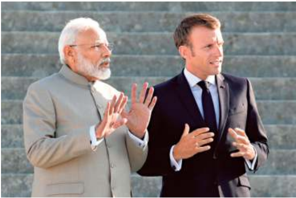
Boost to ties: PM Modi and President Emmanuel Macron before their meeting at Chateau of Chantilly.

"Prime Minister Modi explained the decisions to me, and said that this is a sovereign issue for India. France believes that the issue of Kashmir should be resolved between India and Pakistan, and no other party should be involved," Mr. Macron said.