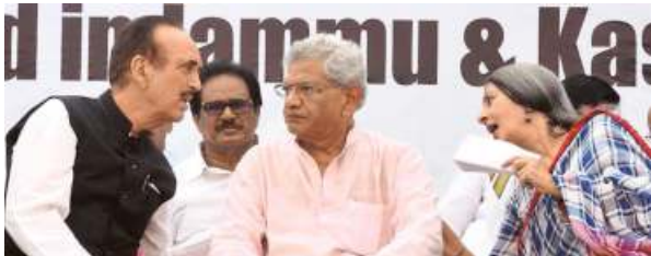
Coming-together: Ghulam Nabi Azad, Sitaram Yechury and Brinda Karat at the protest in Delhi on Thursday.

"We discussed the need to take the protest further to convert it into a campaign. We may meet tomorrow or